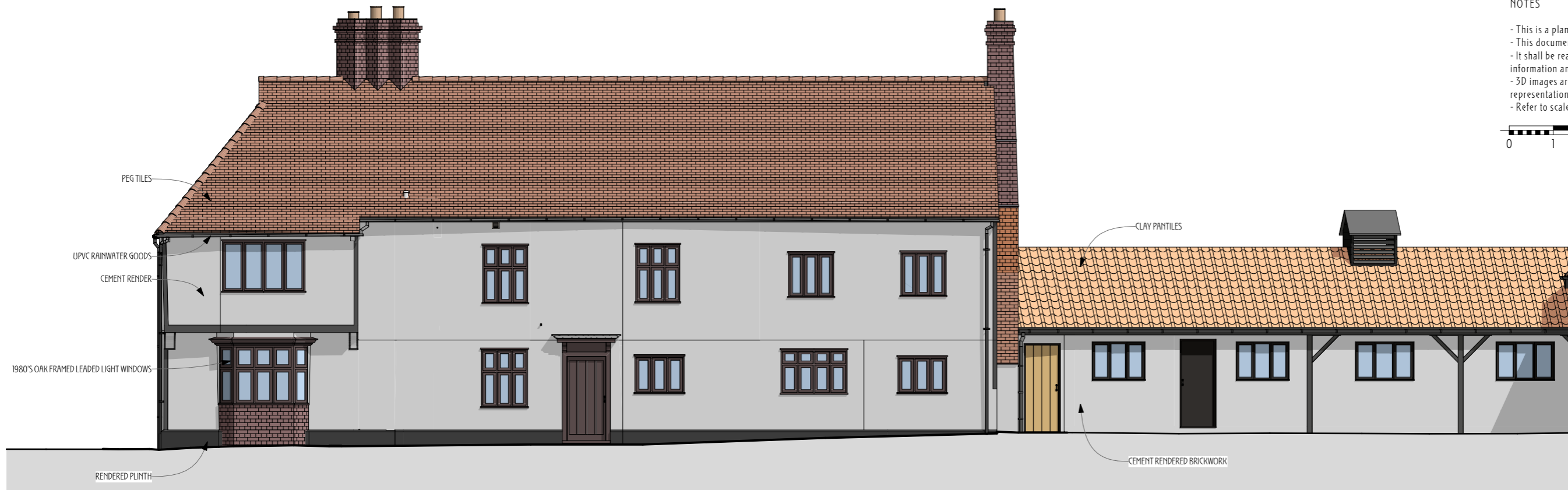
E-01 East Elevation 1:100