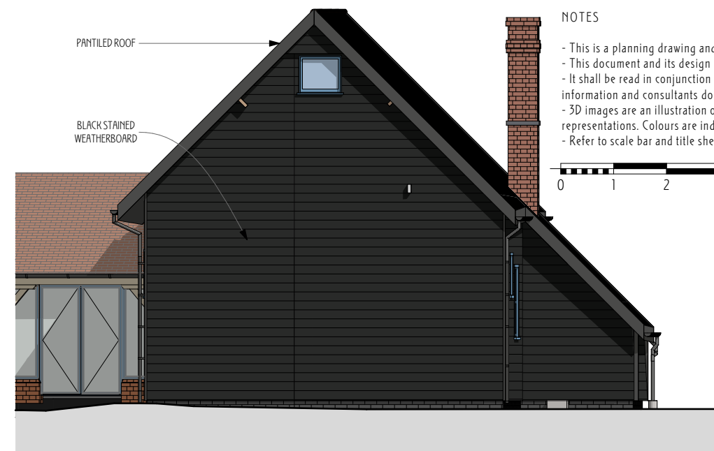
E-06 East Elevation 1:100

NOTES - This is a planning drawing and should not be used for construction. - This document and its design content is copyright ©. - It shall be read in conjunction with all other associated project information and consultants documents. - 3D images are an illustration only, and are not accurate representations. Colours are indicative only. - Refer to scale bar and title sheet to check printing scale.