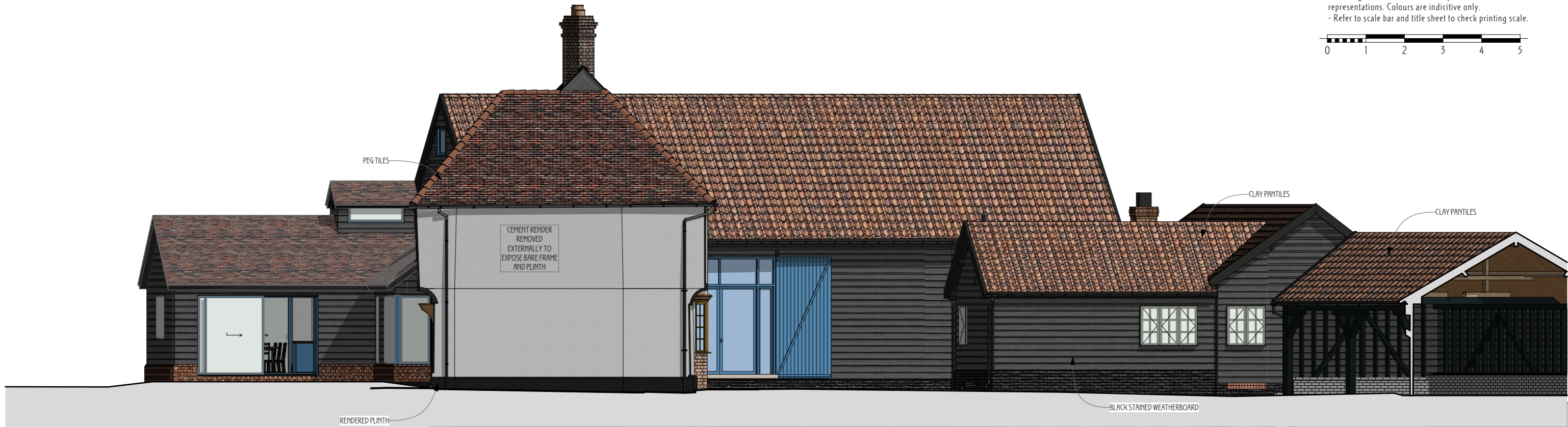
E-02 South Elevation 1:100