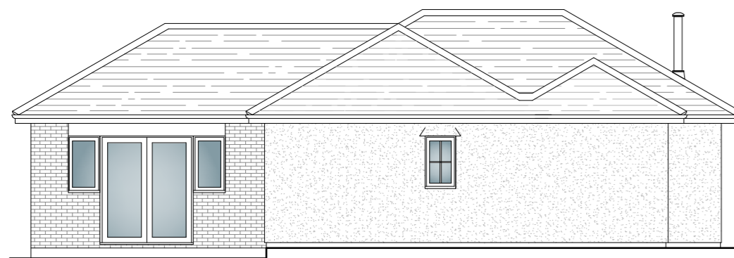
SIDE ELEVATION – EAST