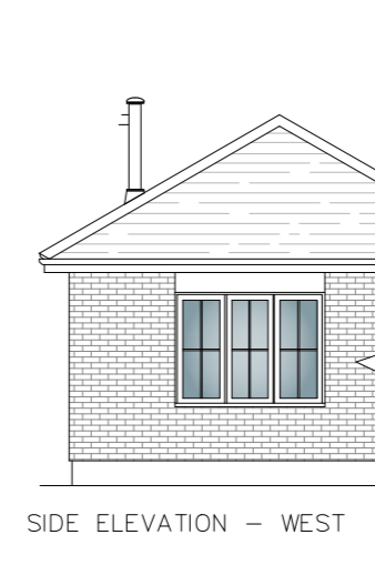
SIDE ELEVATION – WEST