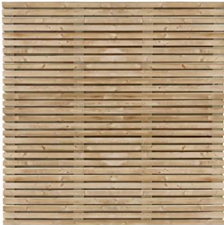
The proposal will use Oostende pinewood garden screen as above.

Garden Fence Screen to in pressure treated pine timber. (Refer to approved drawing 2317/05 for location)