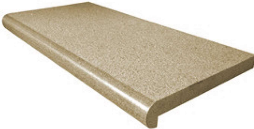
Sandstone coping stone to be used as pool surround

Sandstone coping ledge with paving slabs to match Swimming pool to be surrounded by sandstone coping ledge with matching 600x600mm paving slabs. (Refer to approved drawing 2317/03C for location of paving)