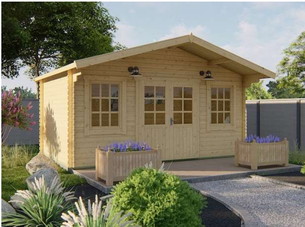
The proposal will use Skyler log cabin as above

Prefabricated Log Cabin as shown in approved drawing 2317.05.