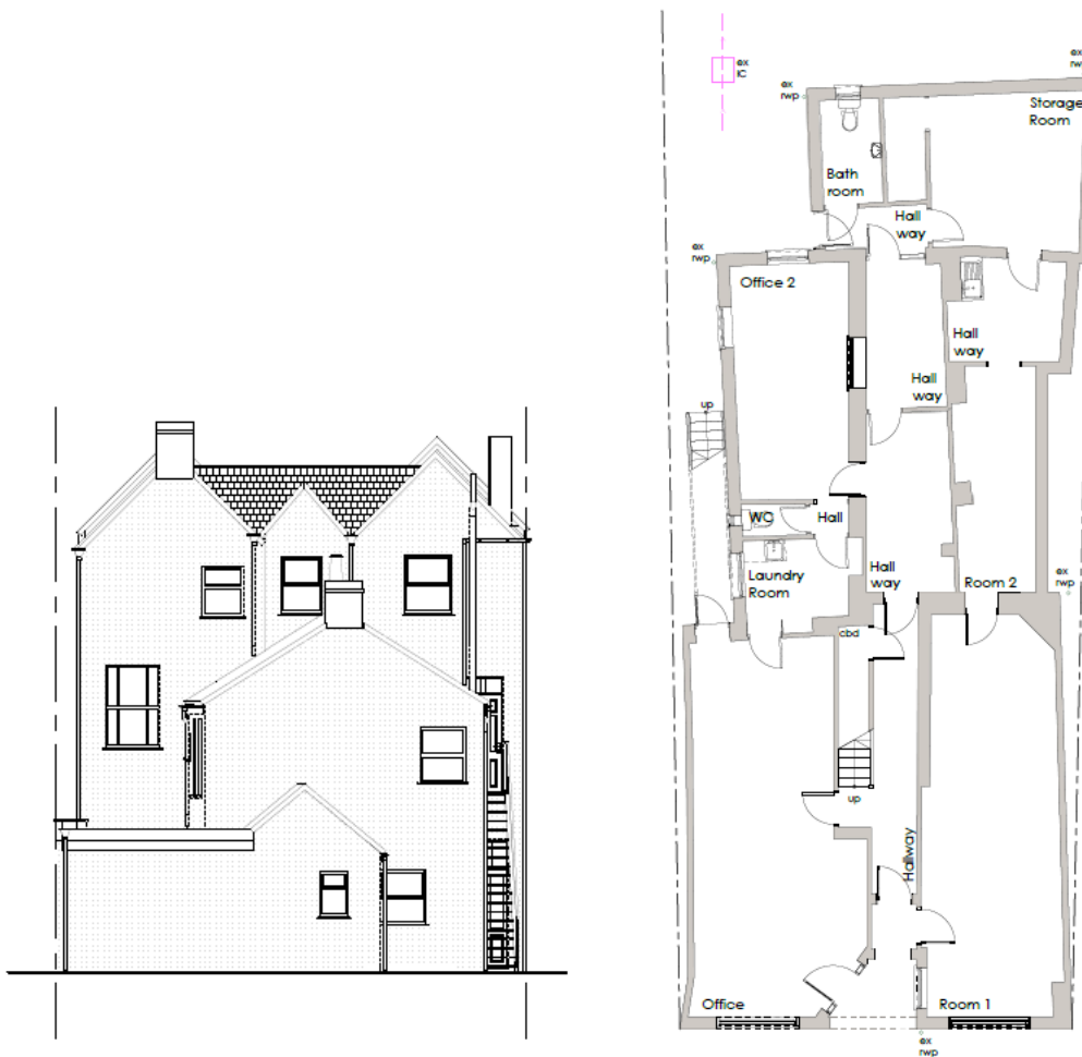
Fig 3 – Existing Rear Elevation & Ground Floor Plan

The proposed scheme seeks to demolish and replace the current single storey rear extension to the rear of the building (east) which is used currently for storage and incorporates a w.c within the structure. The proposal seeks permission to demolish this and construct a larger extension similar in design to the existing which incorporates a larger open plan space which will be used to host yoga classes (Class E). Internal alterations are also proposed by removing non structural internal walls on the ground floor to the south of the building to create a large room. The new extension will visually be similar in design to the existing single storey element with rendered walls with a pitched roof element finished with interlocking tiles and an extension of the existing flat roof on the south side of the building. There will be 4no. rooflights on the pitched roof with 3 no. flat roof rooflights and a lantern rooflight on the flat roof to provide light into the existing internal room and the new studio room. A fire escape door will also be provided on the new extension on the north side of the building.