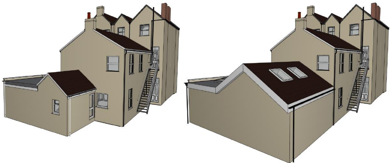
Fig 5 – Existing and Proposed 3D Images of the Rear (east) & Side (north) Elevations

It is considered that the proposed works will have a negligible impact with regards to the overall proposed design against the current look of the building and how the structure sits within the