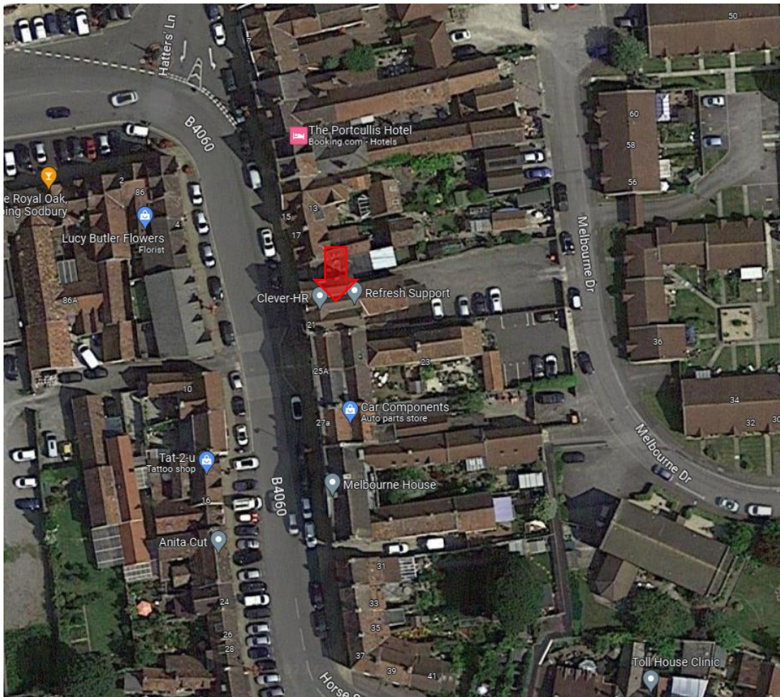
Fig 2: Aerial view of site.