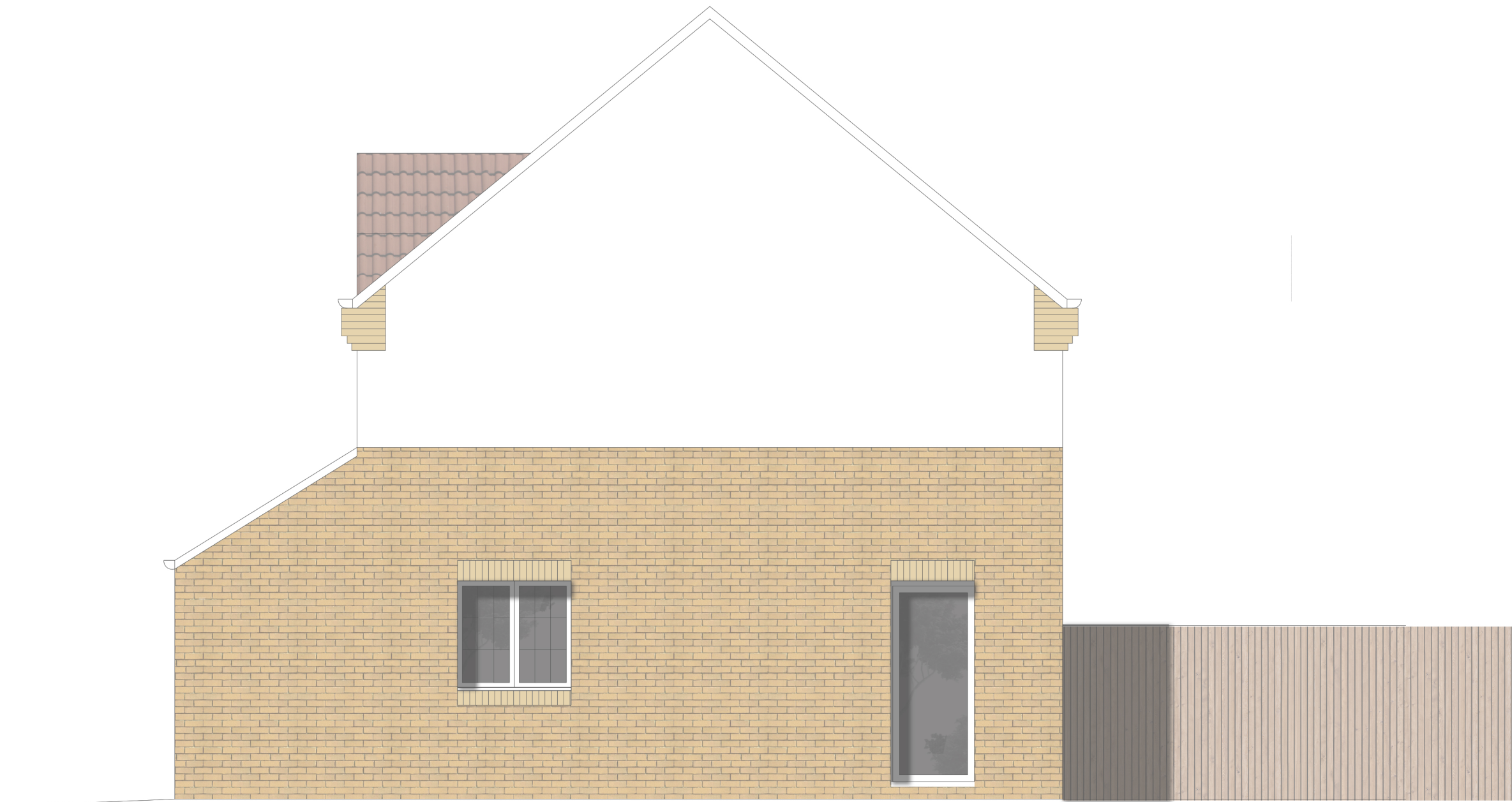
EXISTING SIDE ELEVATION 1:50