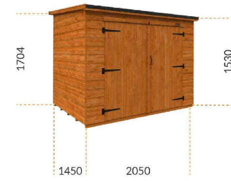
DIAGRAM 1 - PROPOSED BIKE STORAGE