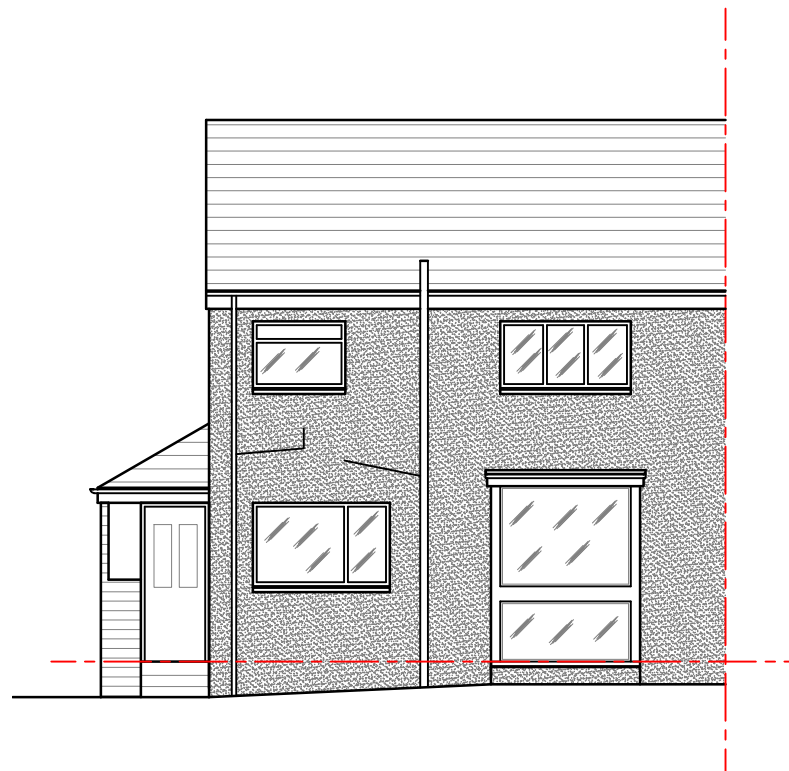
Rear Elevation As Existing