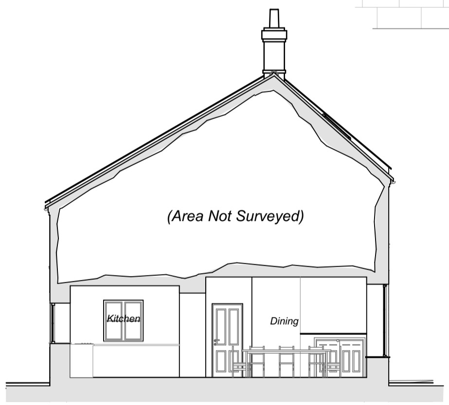
CHA Section A - A 1:100