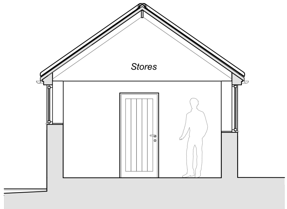
CHA Section C - C 1:50