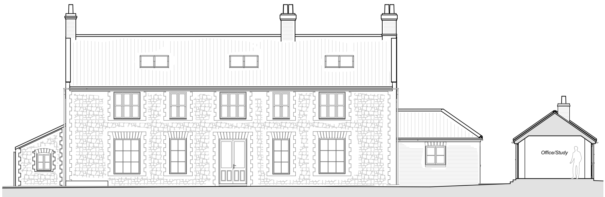
CHA Section B - B (I) 1:100