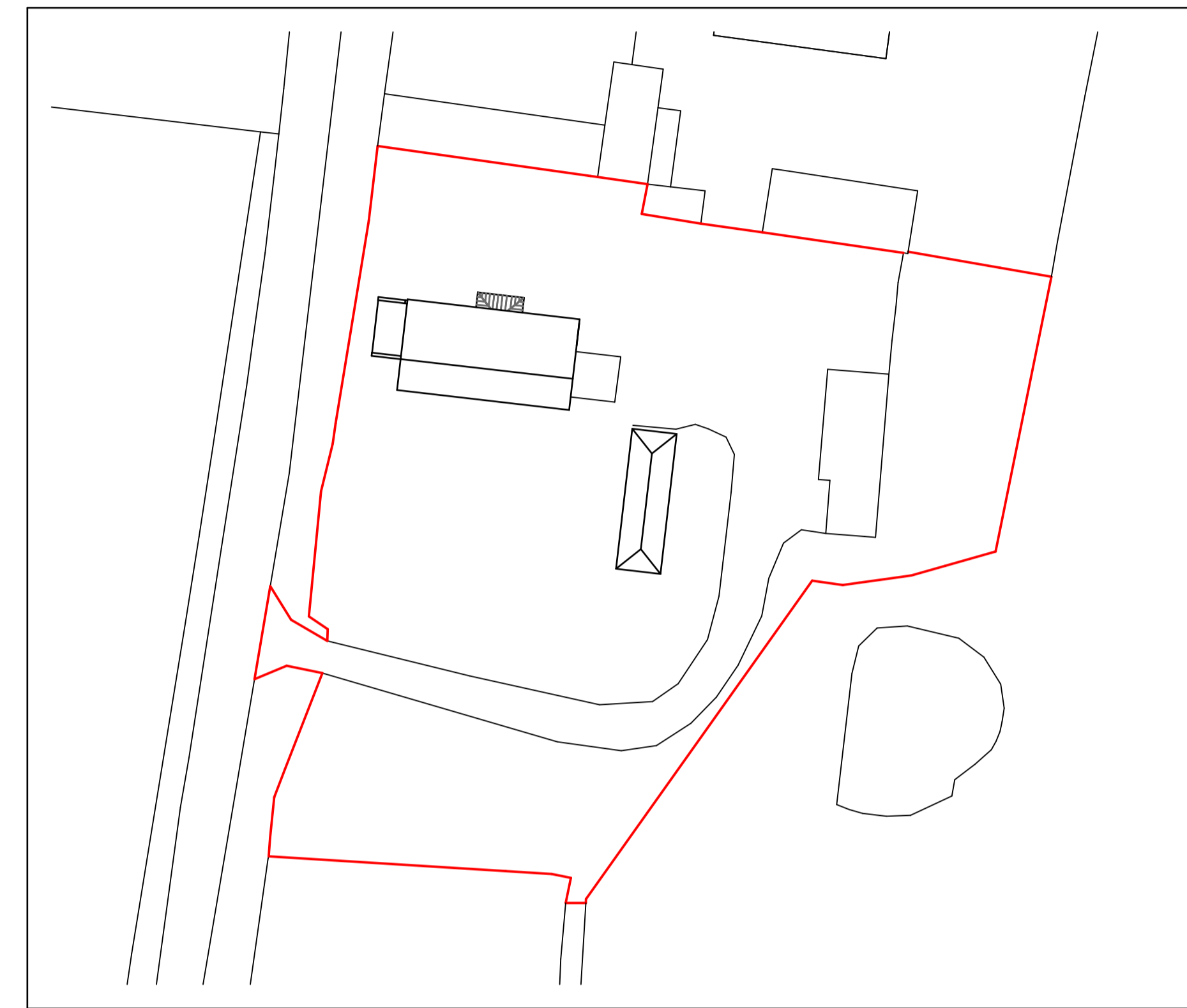
CHA — Site Plan 1:500