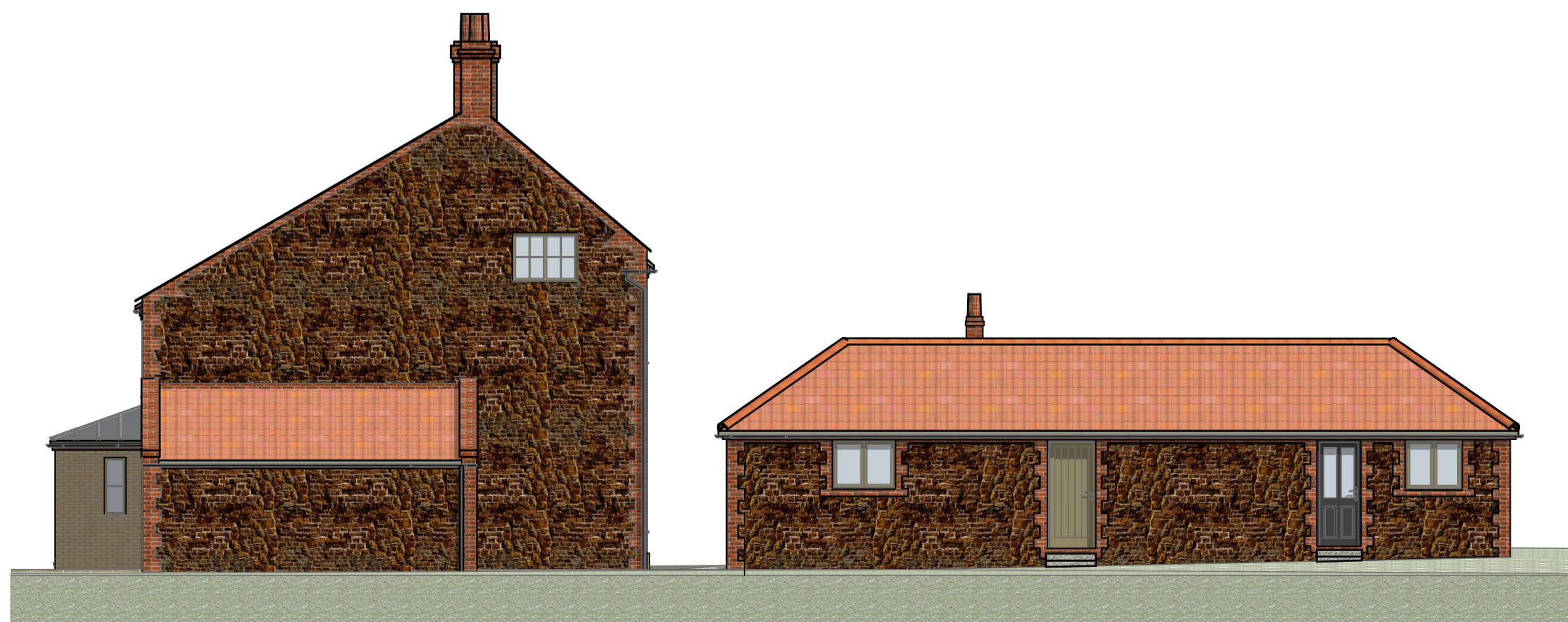
CHA — West Elevation 1:100