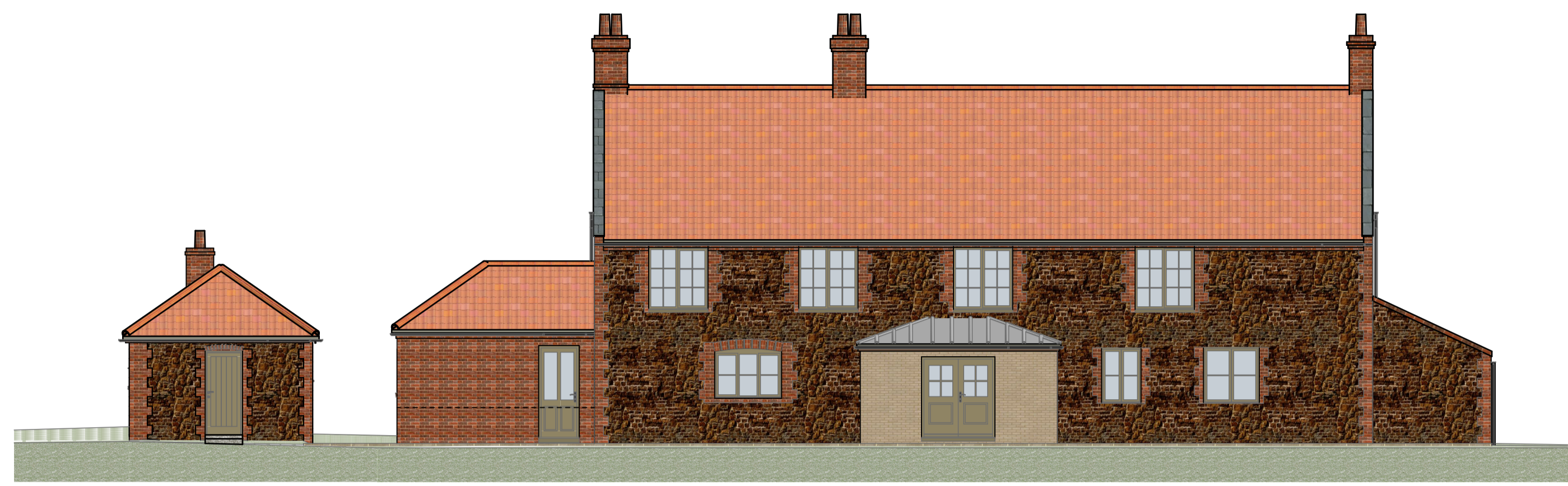
CHA — North Elevation 1:100