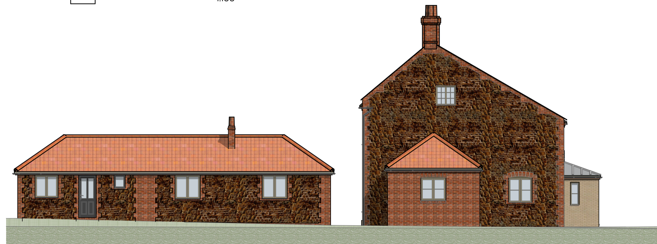
CHA — East Elevation 1:100