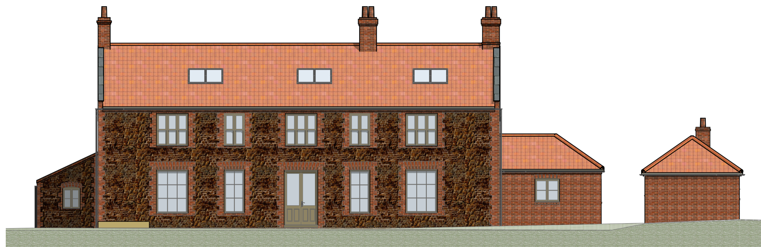
CHA — South East Elevation 1:100