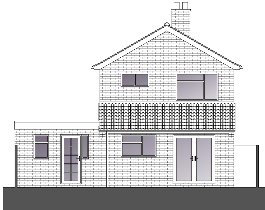
EXISTING EAST (REAR) ELEVATION