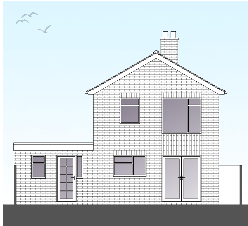
PROPOSED EAST (REAR) ELEVATION