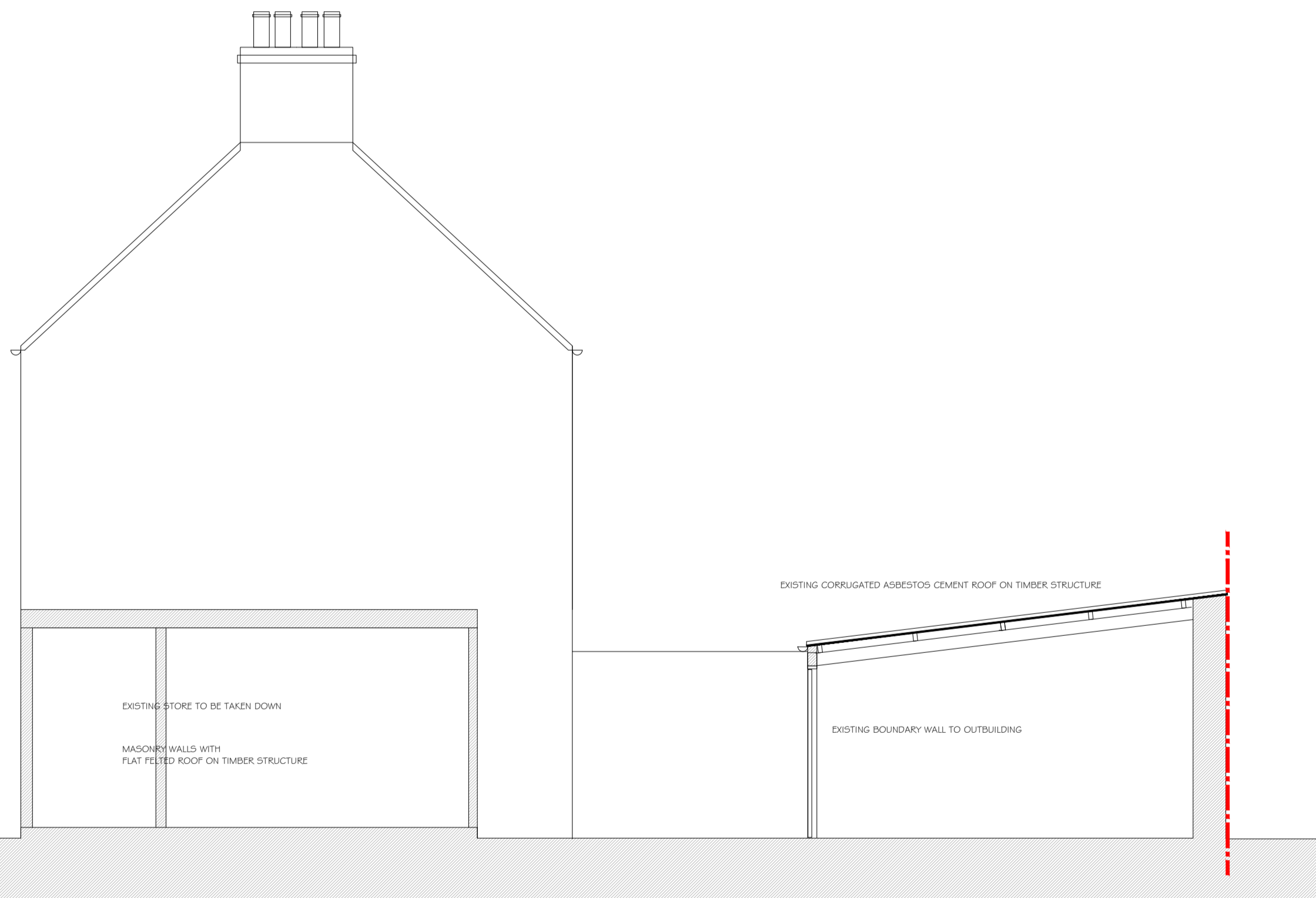
EXISTING CROSS SECTION

R G LICENCE ARCHITECT HILLEND CLIFTON HILL KELSO TD5 7QE T 01573225070 M 07891690639 EMAIL raygarch@icloud.com