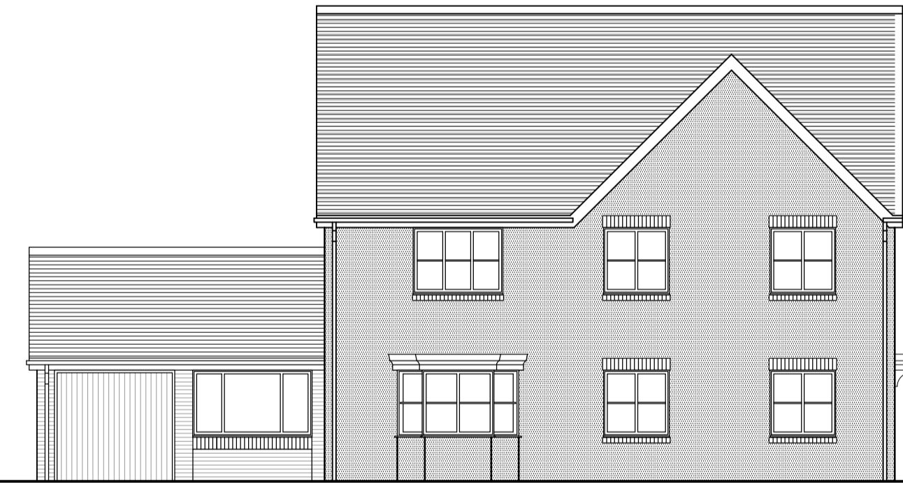
Existing South Elevation Scale: 1:100