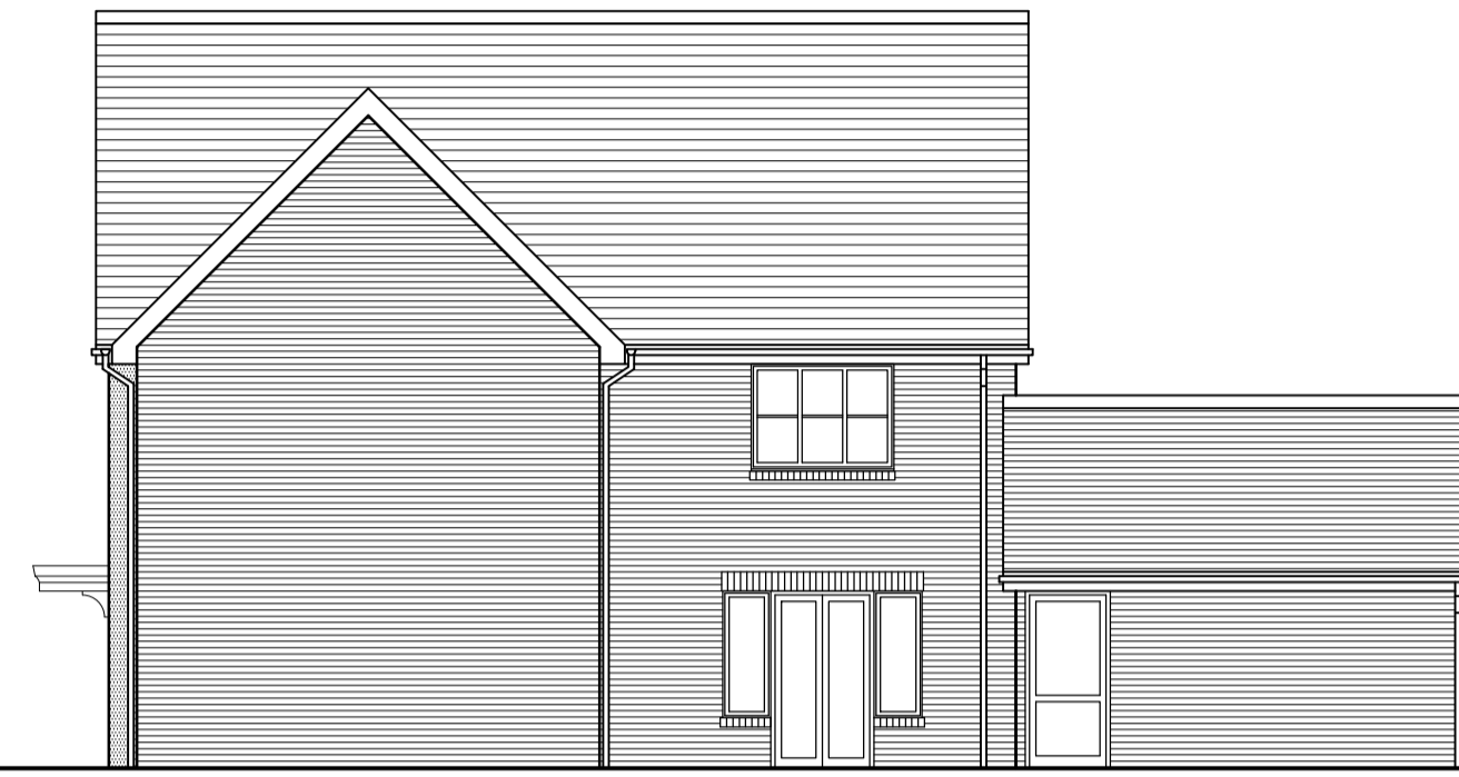
Existing North Elevation Scale: 1:100