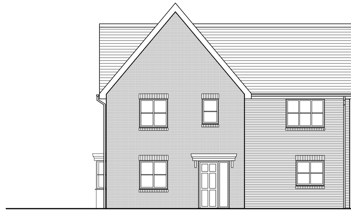
Existing East Elevation Scale: 1:100