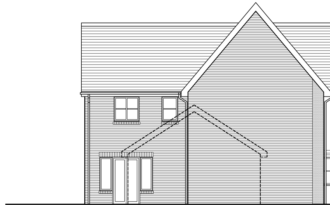
Existing West Elevation Scale: 1:100