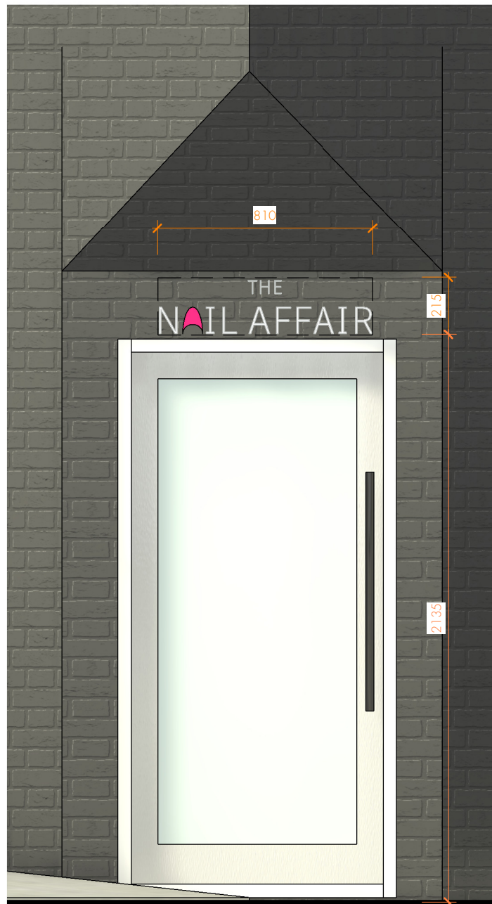
New Signage Elevation