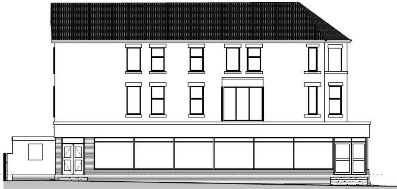
Hopton Rd Elevation 1 : 100

The proposed site is only on the first and second floor All external windows and materials are unchanged.