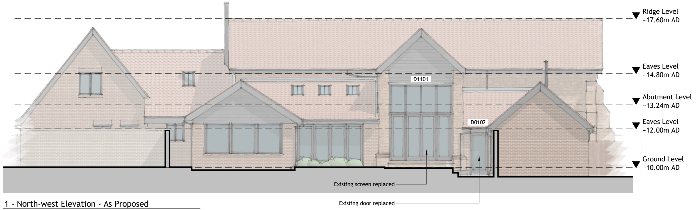
1 - North-west Elevation - As Proposed Scale 1:100 at A3