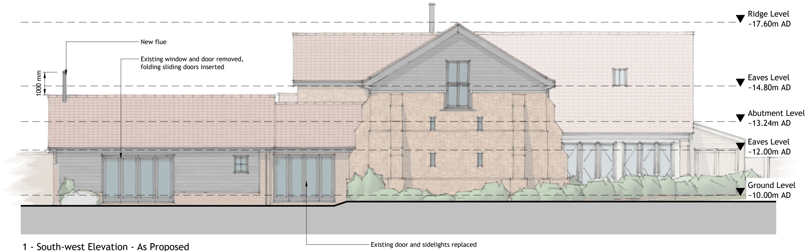
1 - South-west Elevation - As Proposed Scale 1:100 at A3