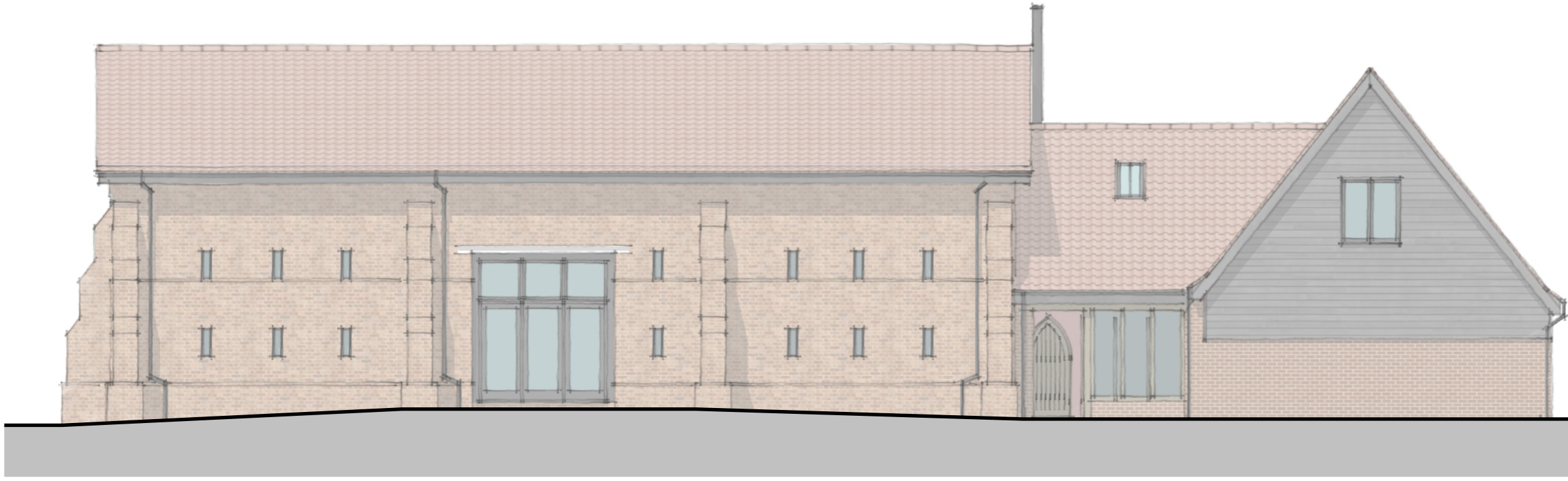
1 - South-east Elevation - As Existing Scale 1:100 at A3