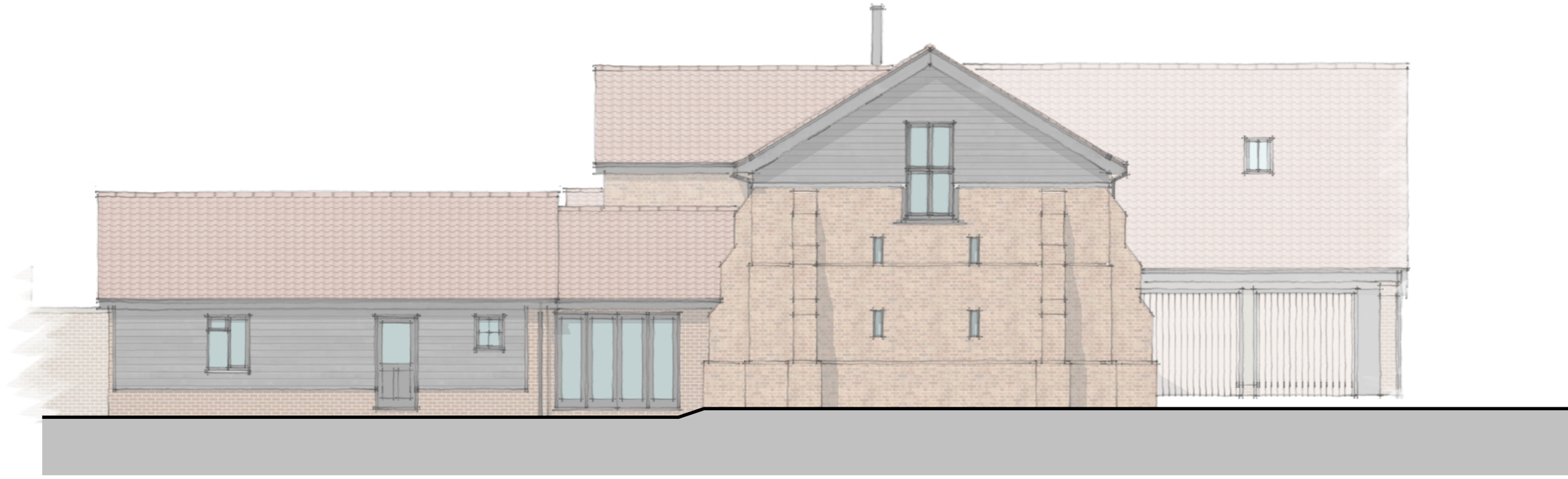
1 - South-west Elevation - As Existing Scale 1:100 at A3