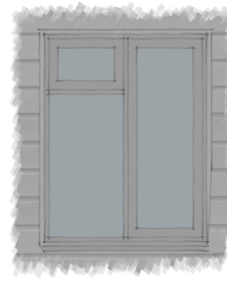
W1301 - Home Office - Moved from R12

2 - Glazed Panelled Door Scale 1:20 at A3