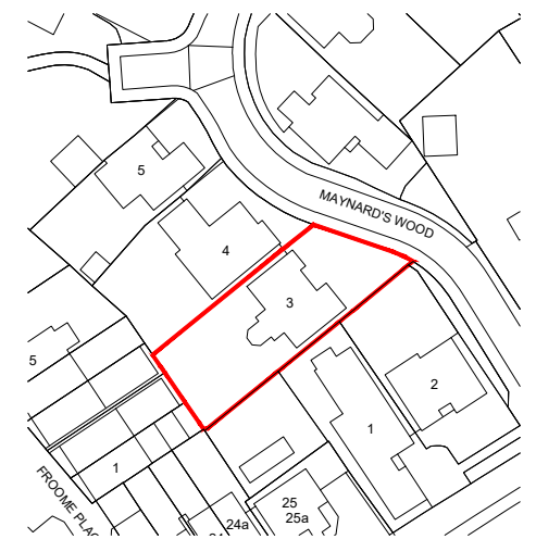
Site Location Plan (NTS) Ordnance Survey 100053143