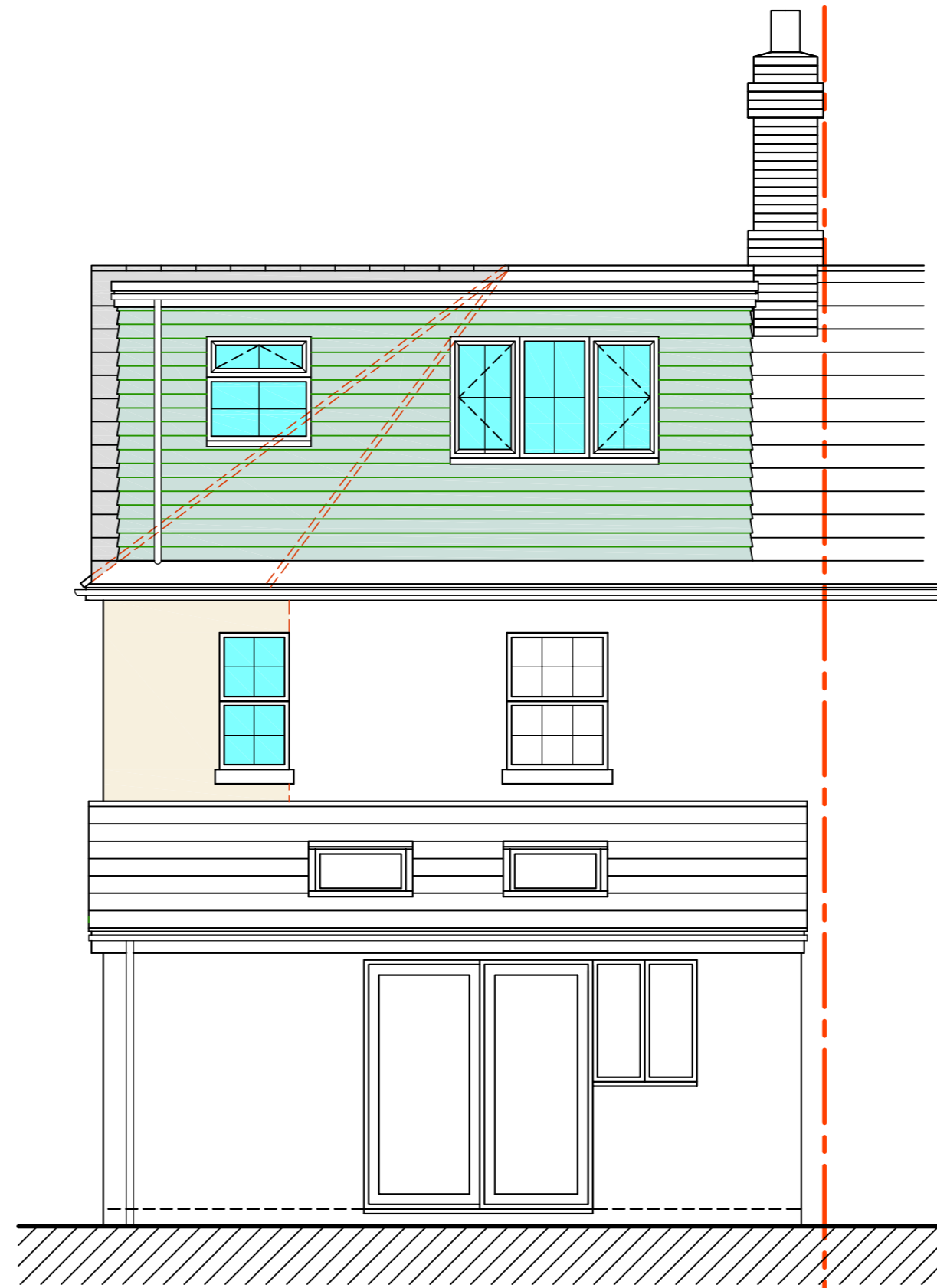
REAR ELEVATION ( WEST )