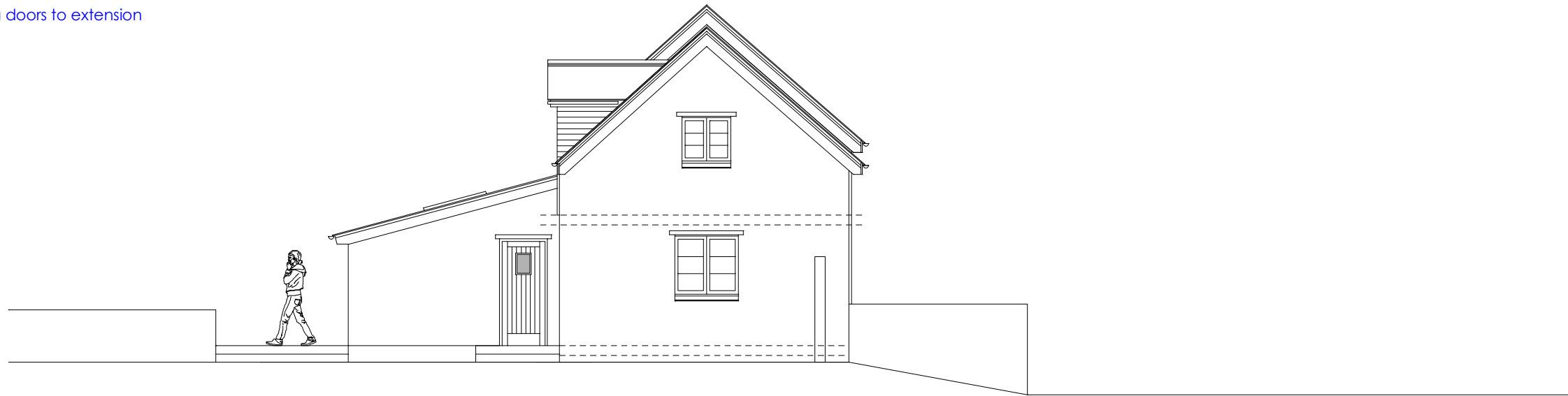
Side Elevation (North)