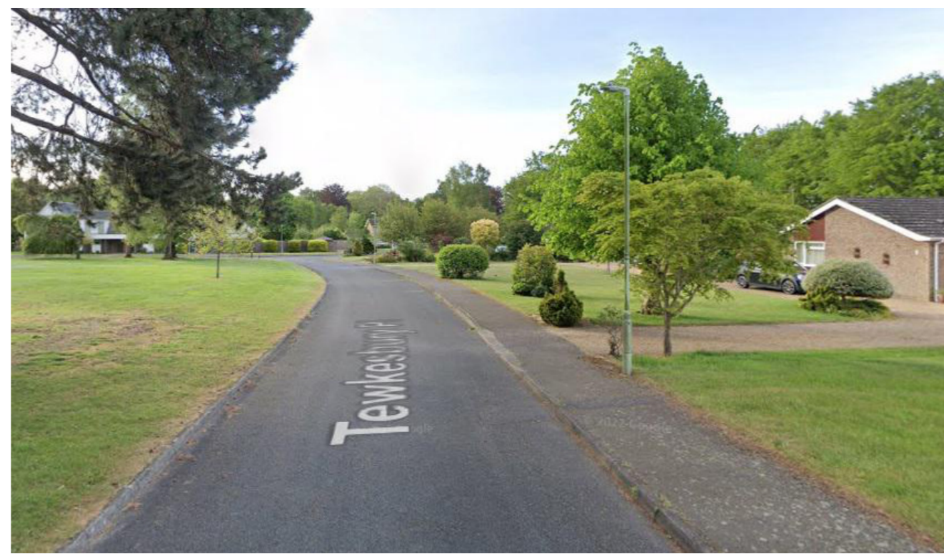
3 PHOTO 02 NTS