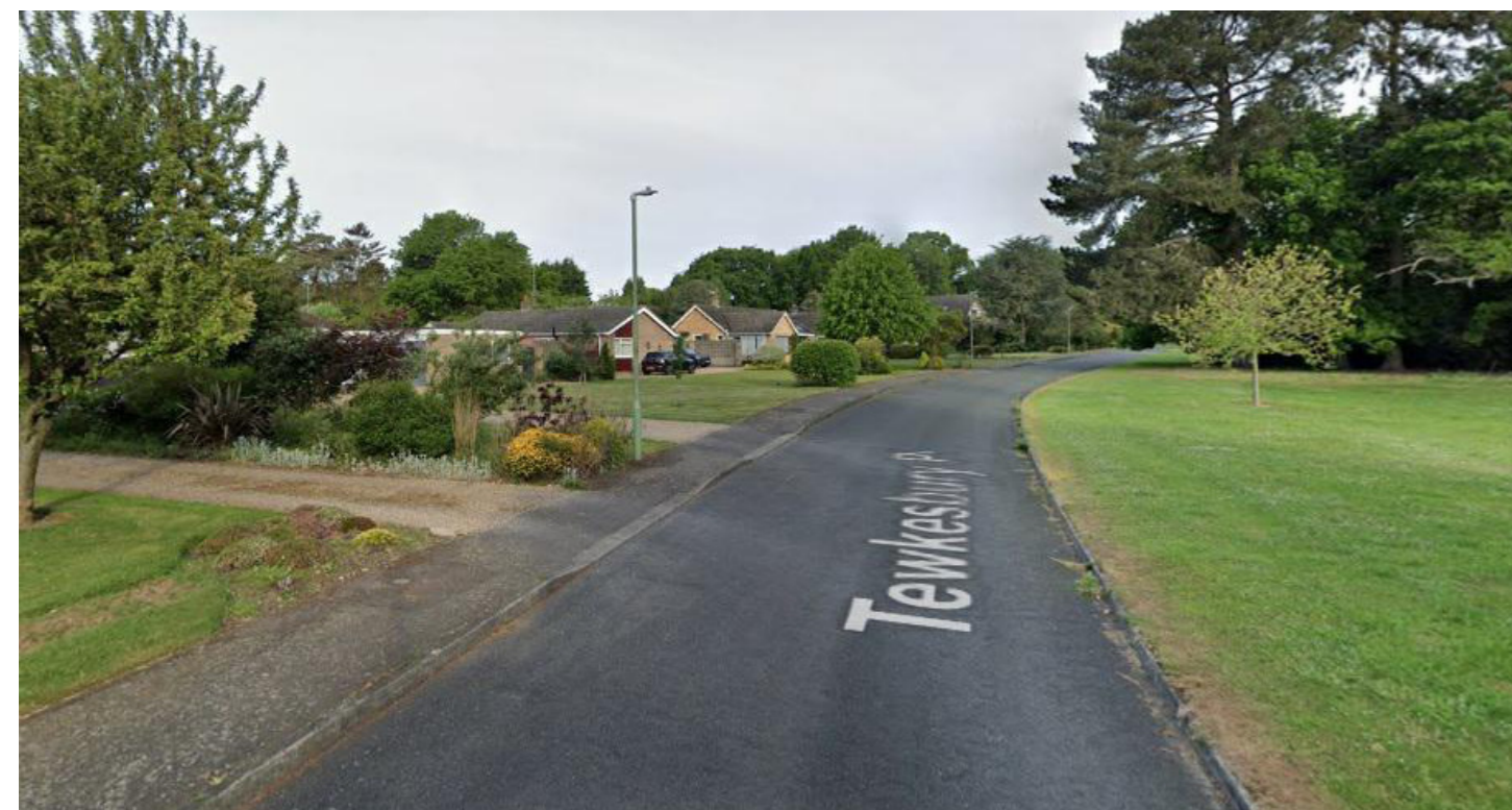
2 PHOTO 01 NTS