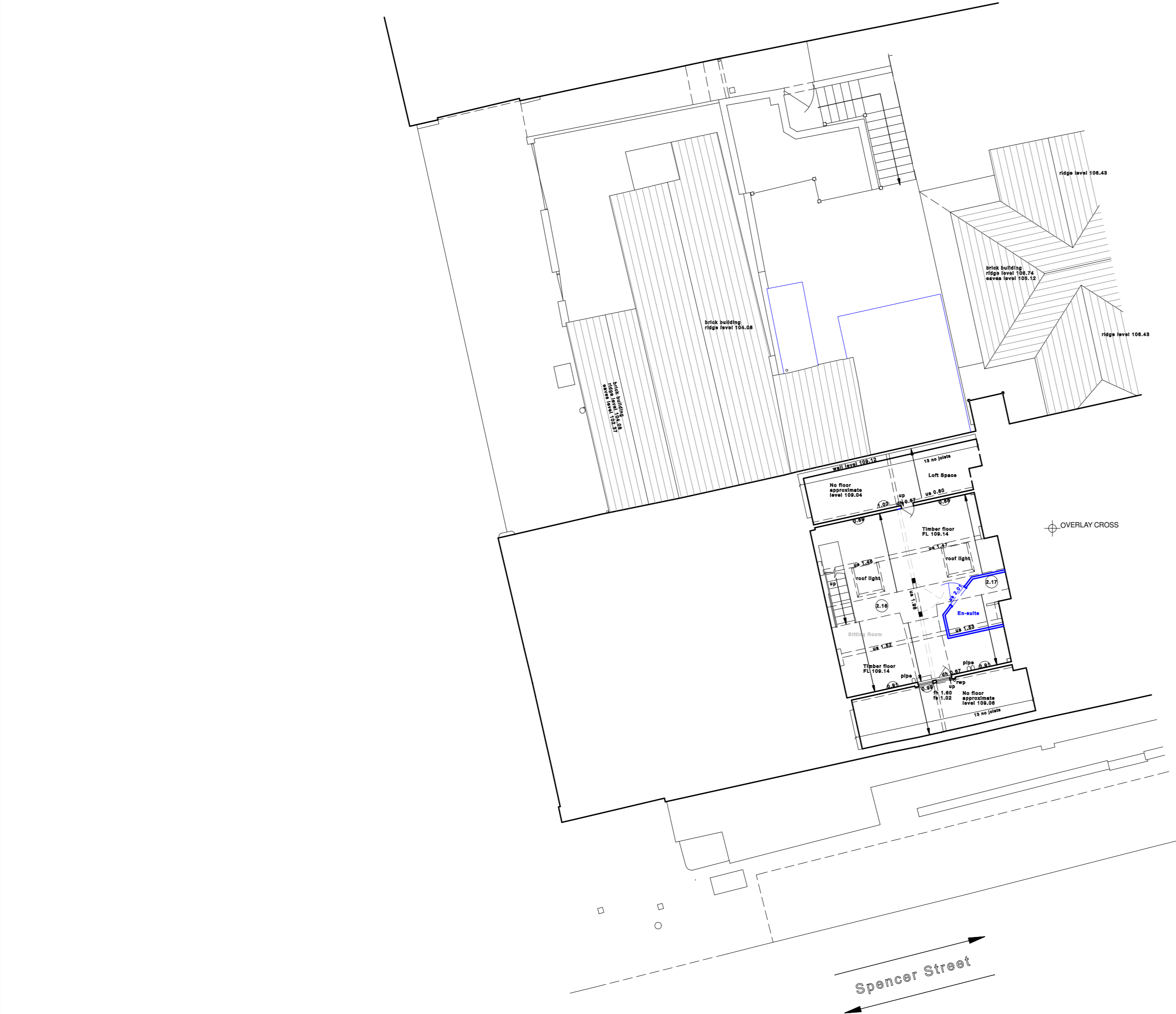
PROPOSED LOFT FLOOR PLAN