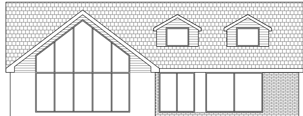
Approved Rear Elevation