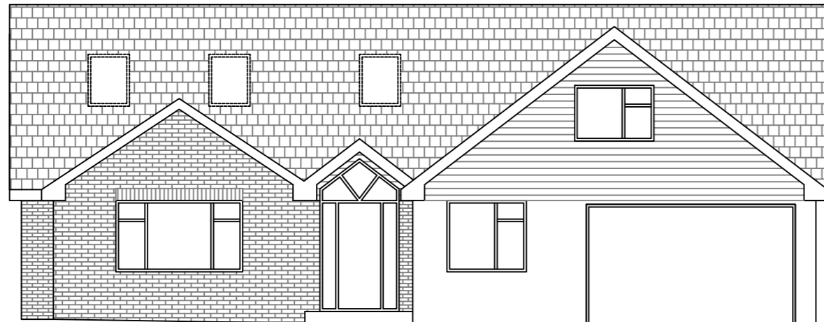
Approved Front Elevation