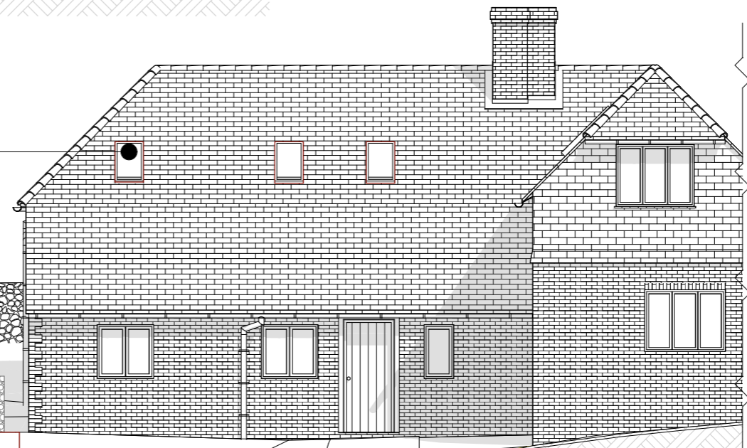
Proposed North Elevation Scale 1:100