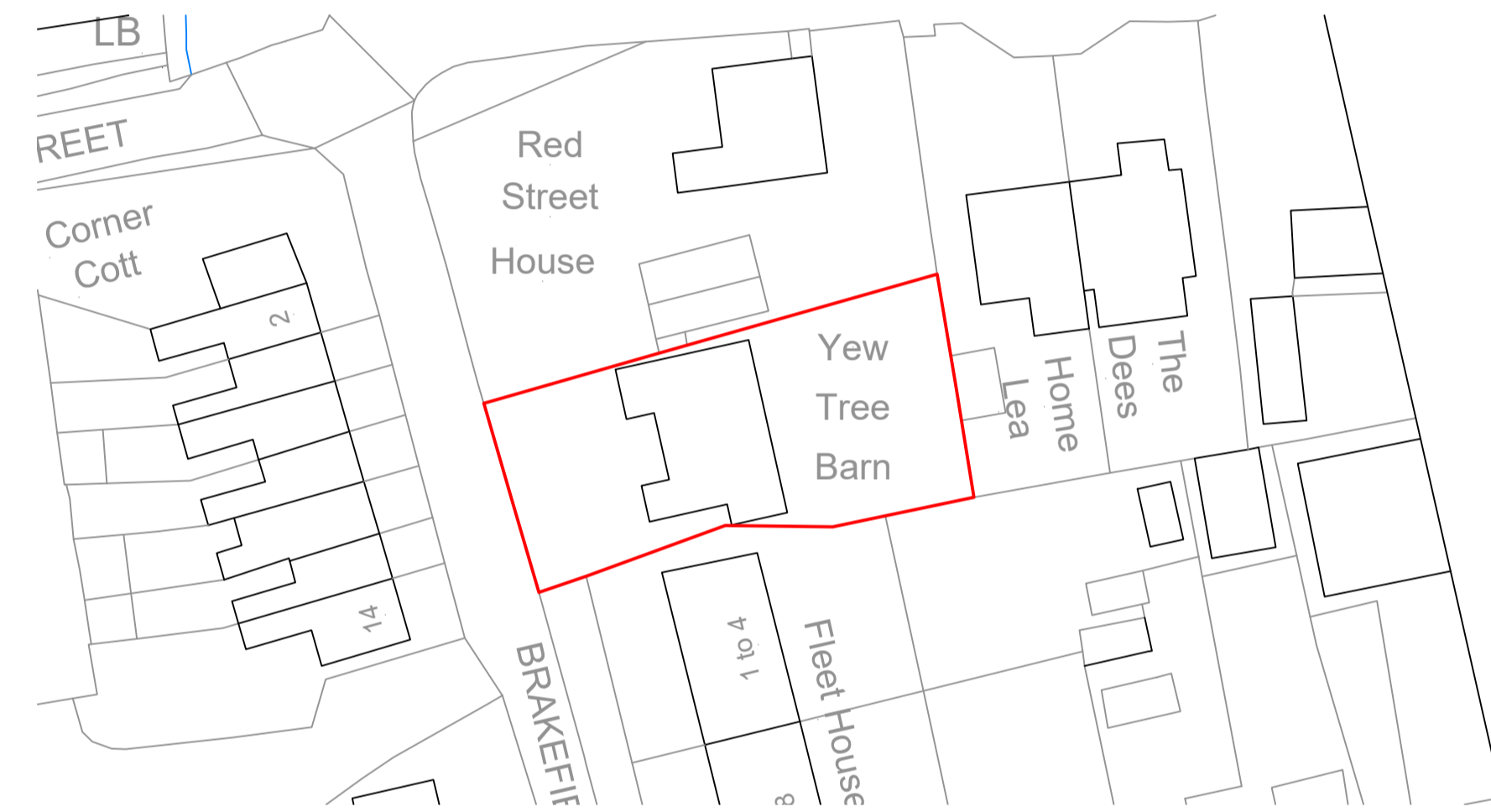
Block plan 1:500