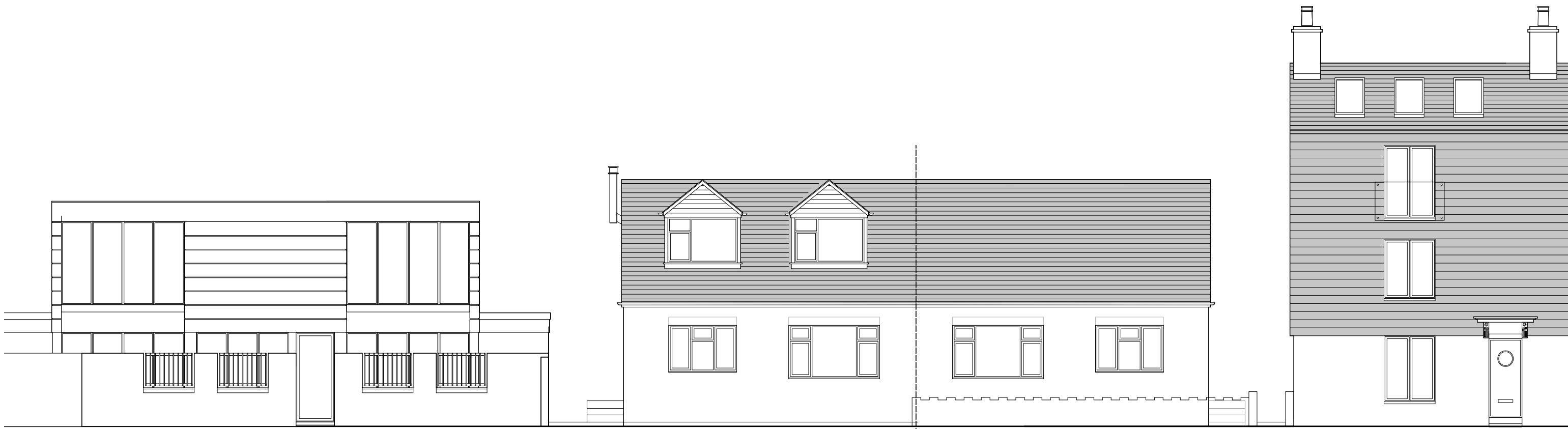
EXISTING FRONT (SOUTH EAST) ELEVATION