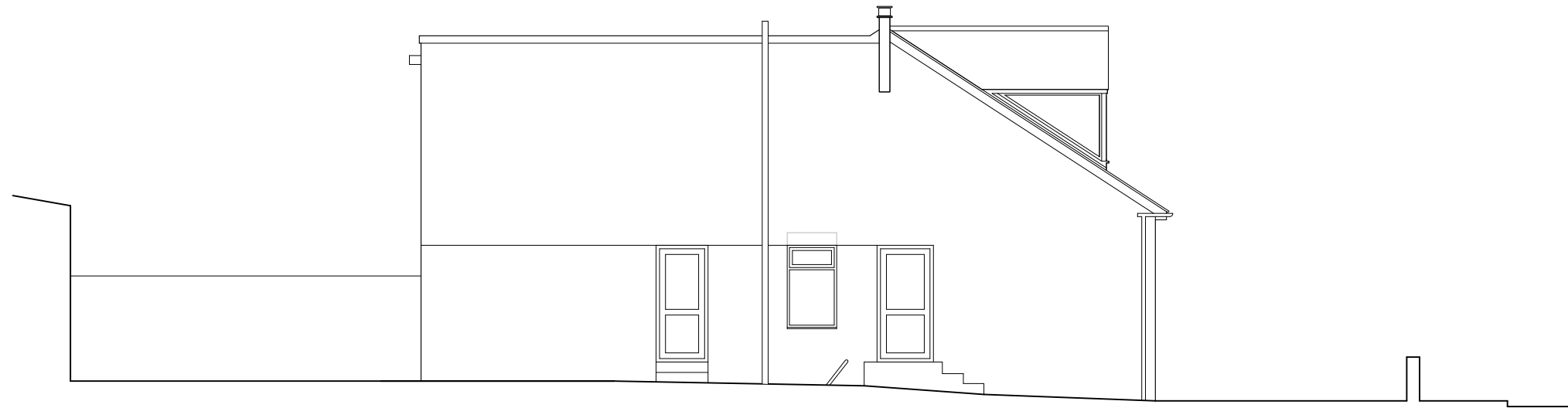
EXISTING SIDE (SOUTH WEST) ELEVATION