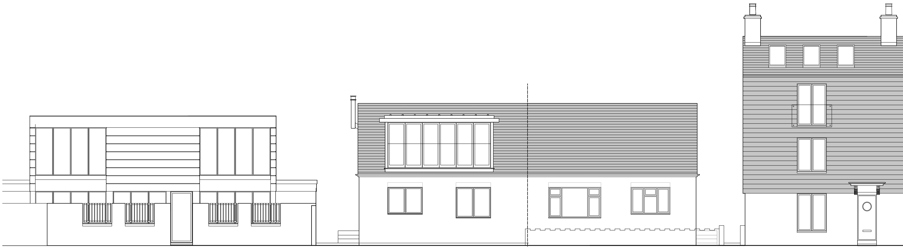
PROPOSED FRONT (SOUTH EAST) ELEVATION