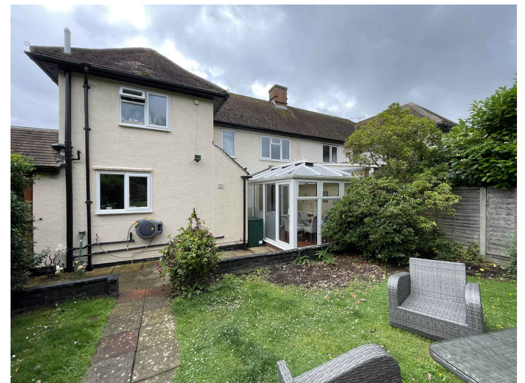
EXISTING SITE PHOTO 004: REAR ELEVATION