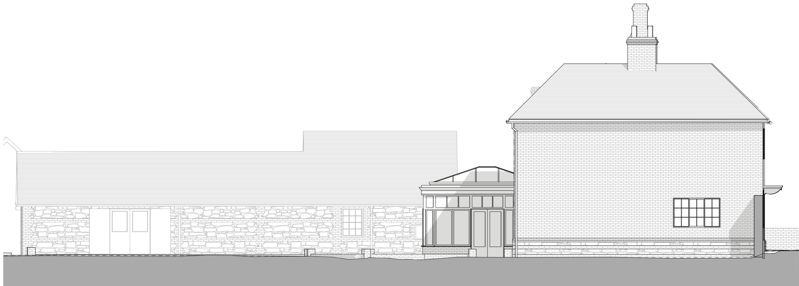
SW House South West Elevation 1:100