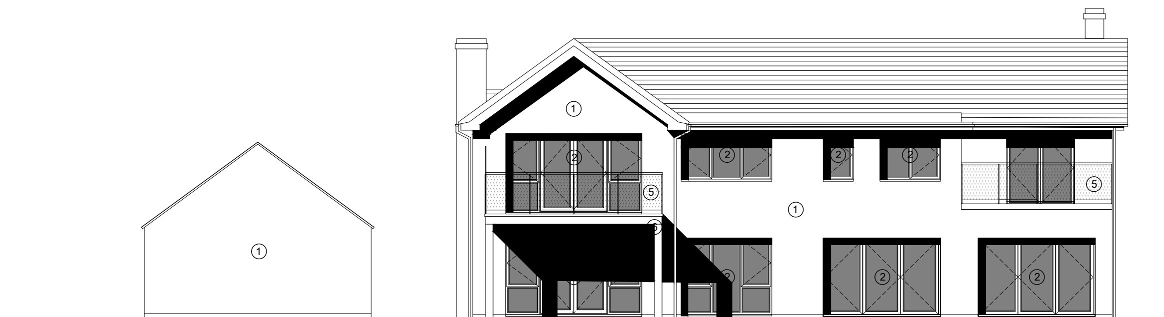
Proposed Rear/ North Elevation