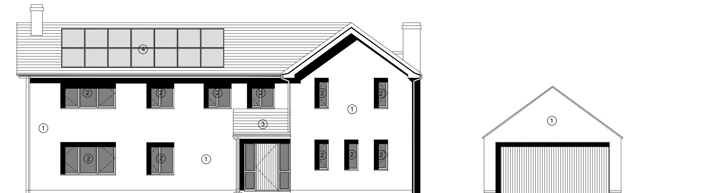
Proposed Front/ South Elevation

It is assumed that all work will be carried out by a competent contractor working, where appropriate, to an approved method statement