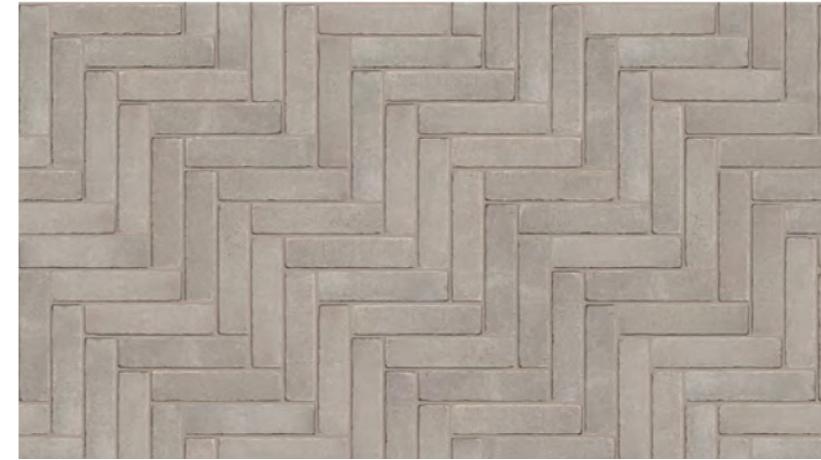
TERRACE NATURAL YORKSTONE PAVING