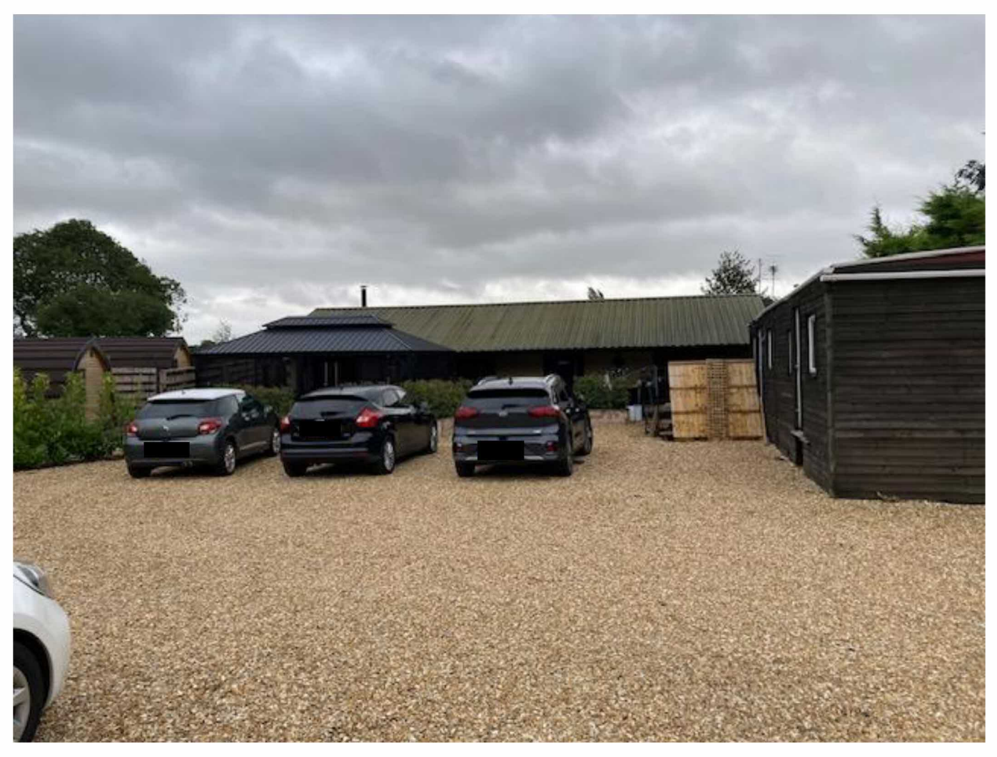
1. The front north west facing view of the guest amenity areas viewed from the gravel drive and parking area.