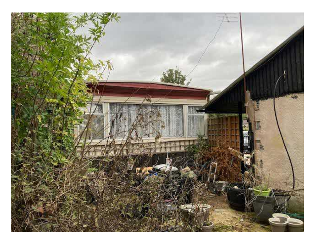
16. The corner junction between the amenity building and smaller front amenity cabin.