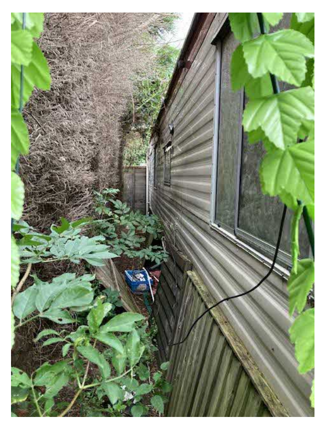
28. Looking west along the rear elevation of the cabin building.