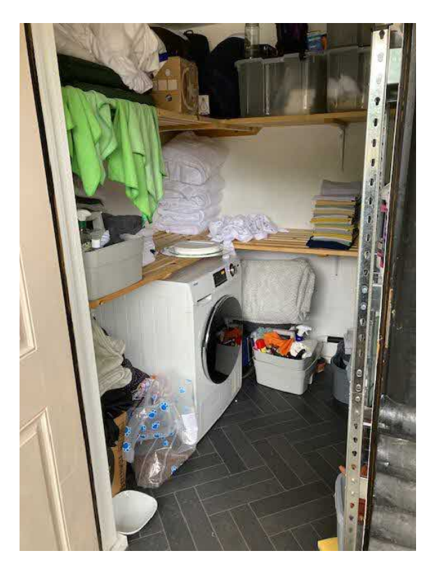
20. Looking into the utility room through the external door.