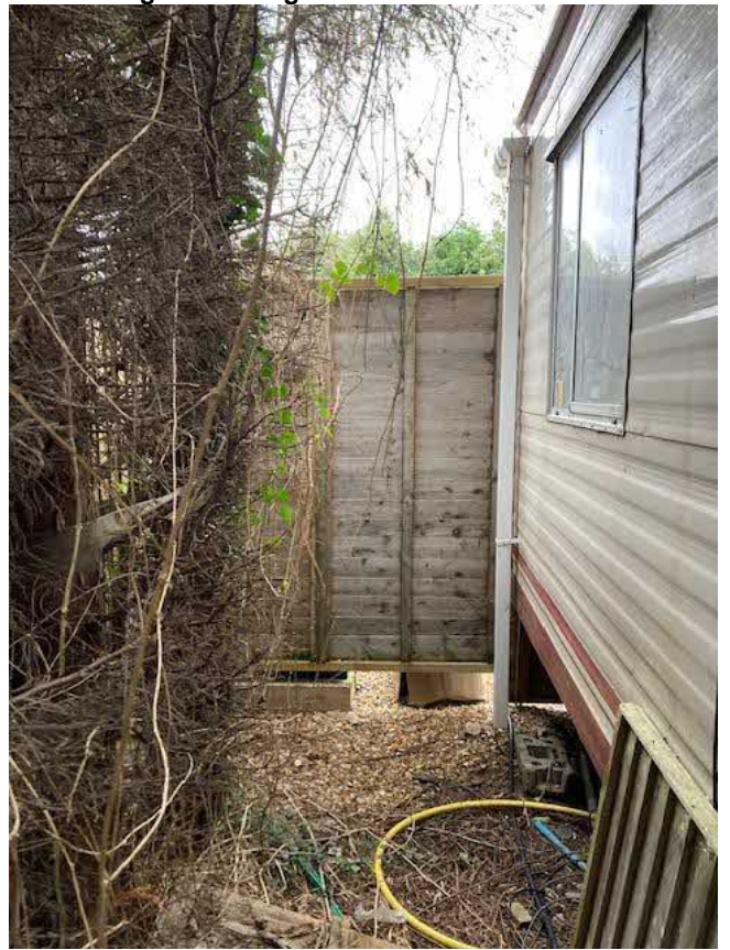
29. The rear west corner of the cabin building and west end fence.