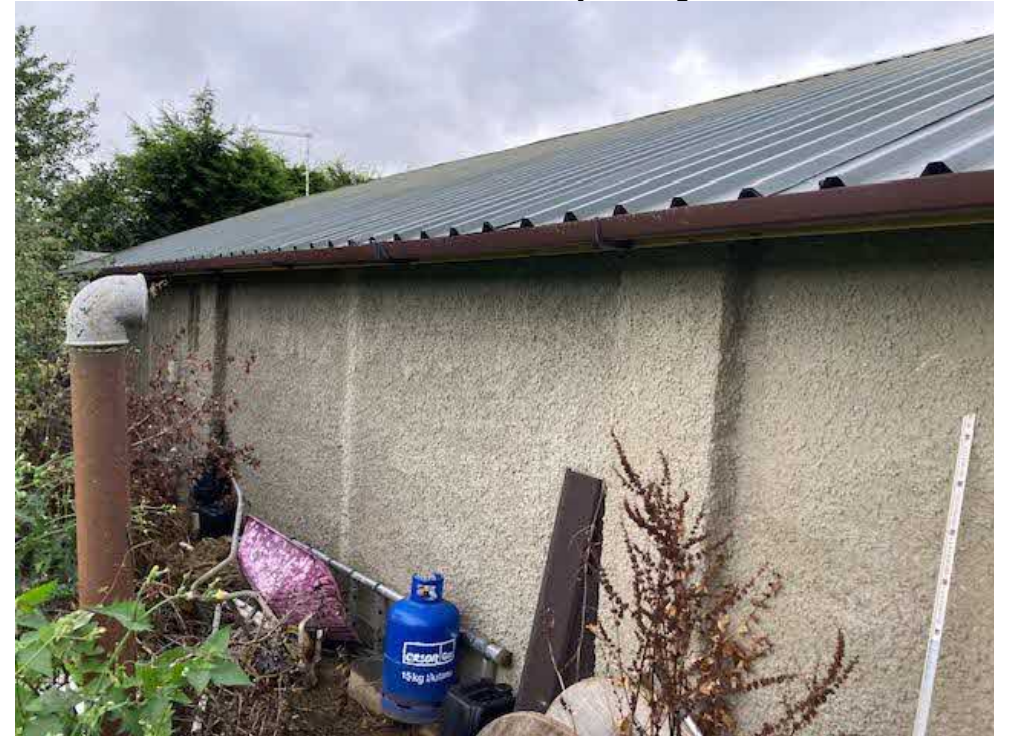
15. The rear south east facing rendered wall of the amenity building.