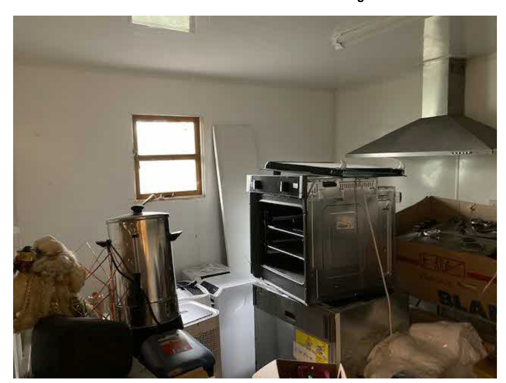
19. The kitchen (used as store room) with rear south east facing small window.