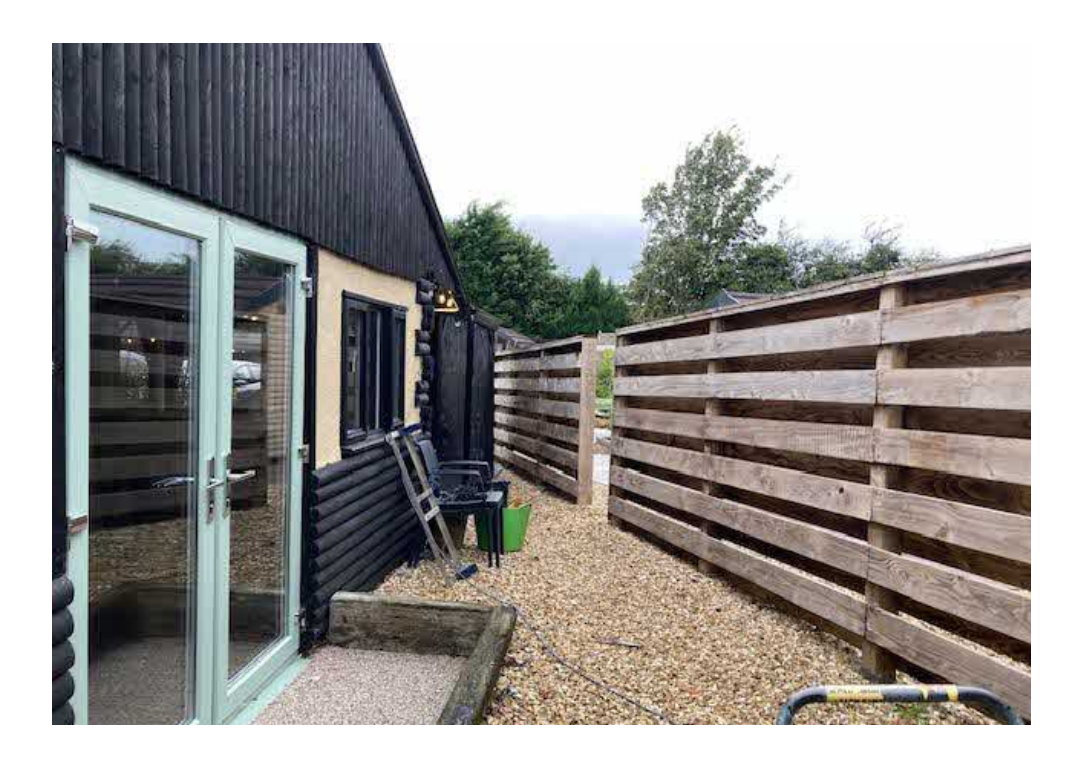
7. The timber screen fence at the north east side of the amenity building.

6. The timber boarded gate at the rear east corner of the amenity building.