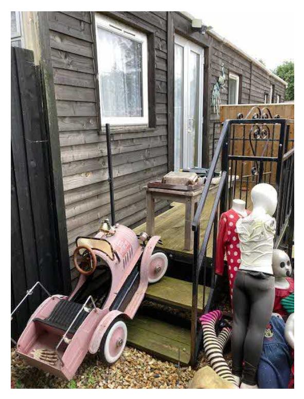
26. The metal and timber raised front deck with steps.