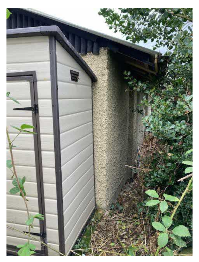
14. The rear south corner of the amenity building and small shed.