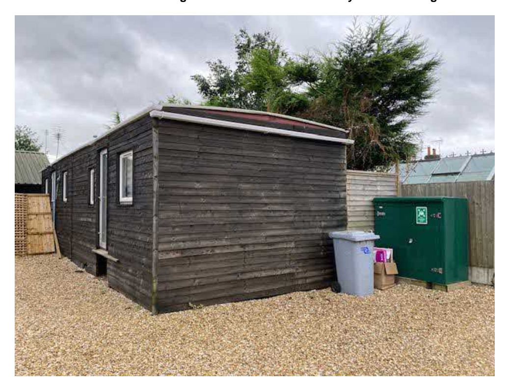
25. The north west end of the cabin amenity building and rear timber fence.