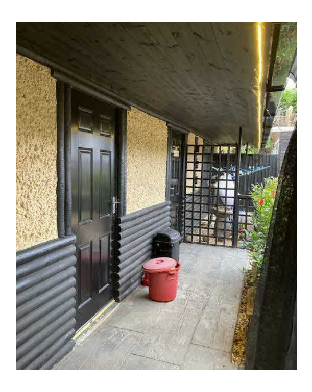
10. Looking west further under the front covered path.