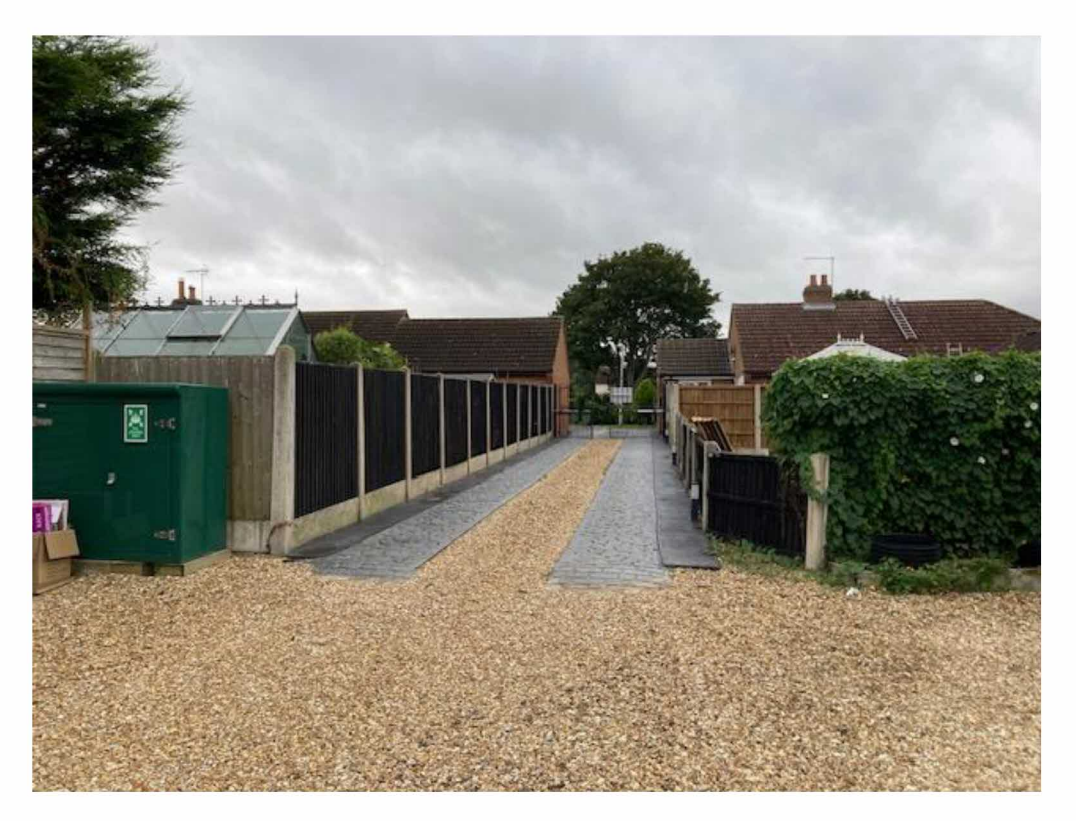
30. Looking north west along the entrance drive from the gravel car parking area.