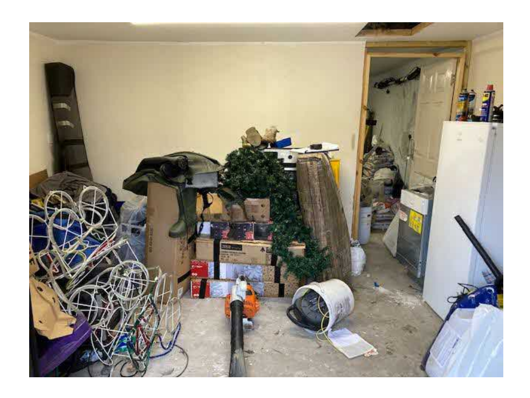
22. Looking into the front south store room through the pair of timber double doors.