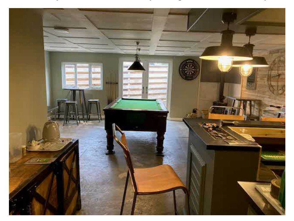
17. The games room in the east end of the amenity building.