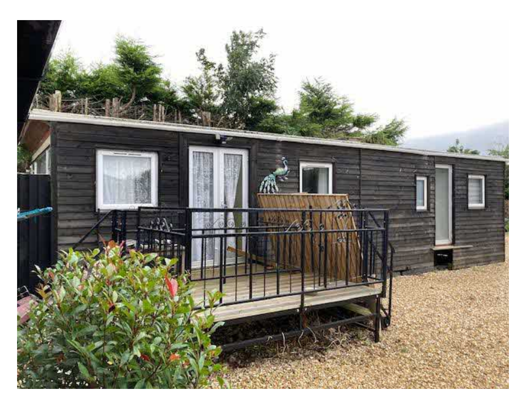
24. The front north east facing elevation of the front amenity cabin building.