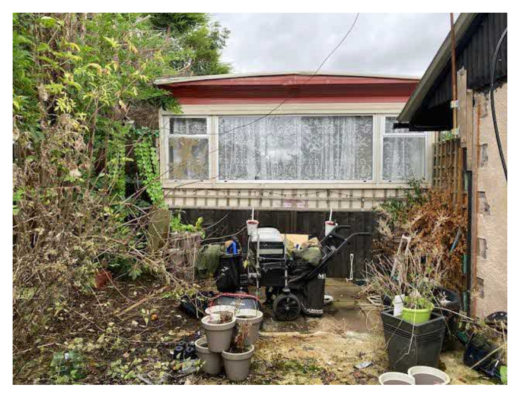
27. The large window in the south east end of the amenity cabin building.