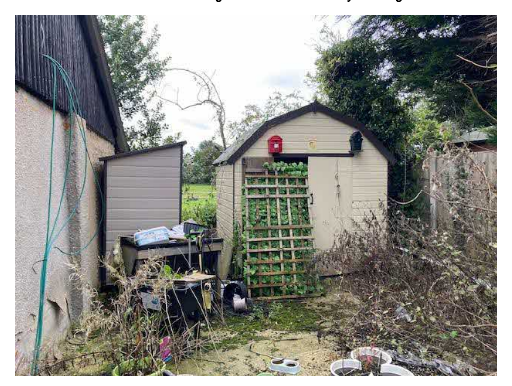
13. Sheds in the south corner back yard.