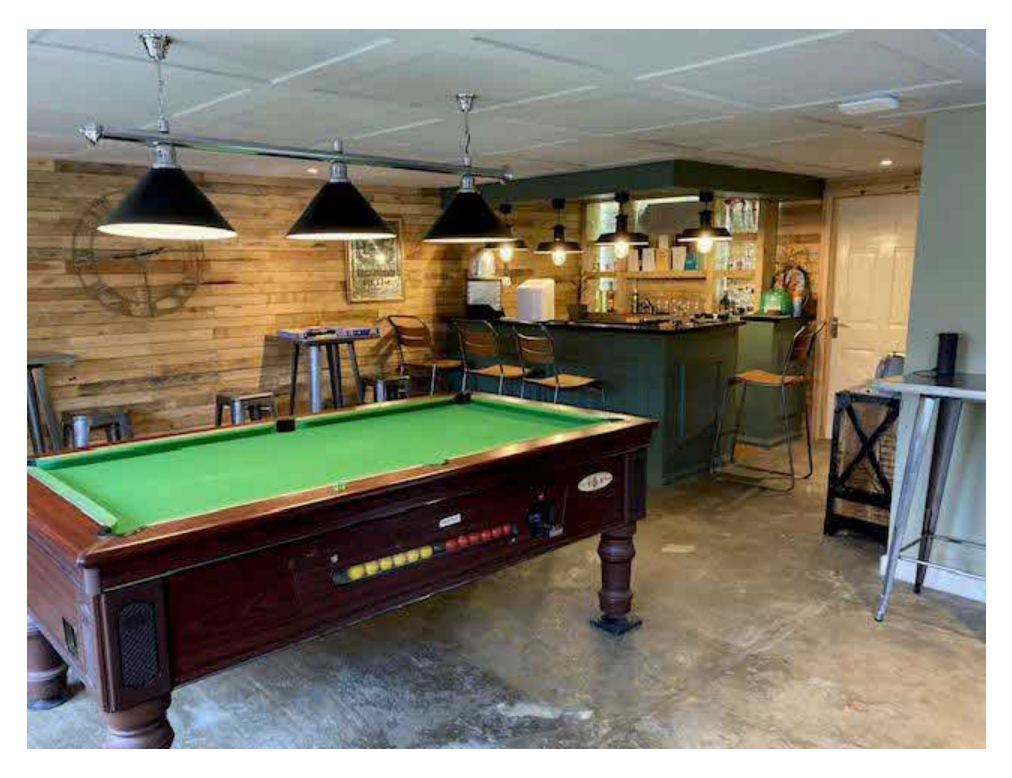
18. The bar and kitchen door at the rear south corner of the games room.