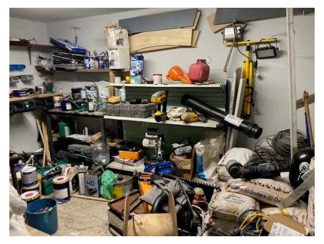
23. The rear workshop store room behind the above south store room.