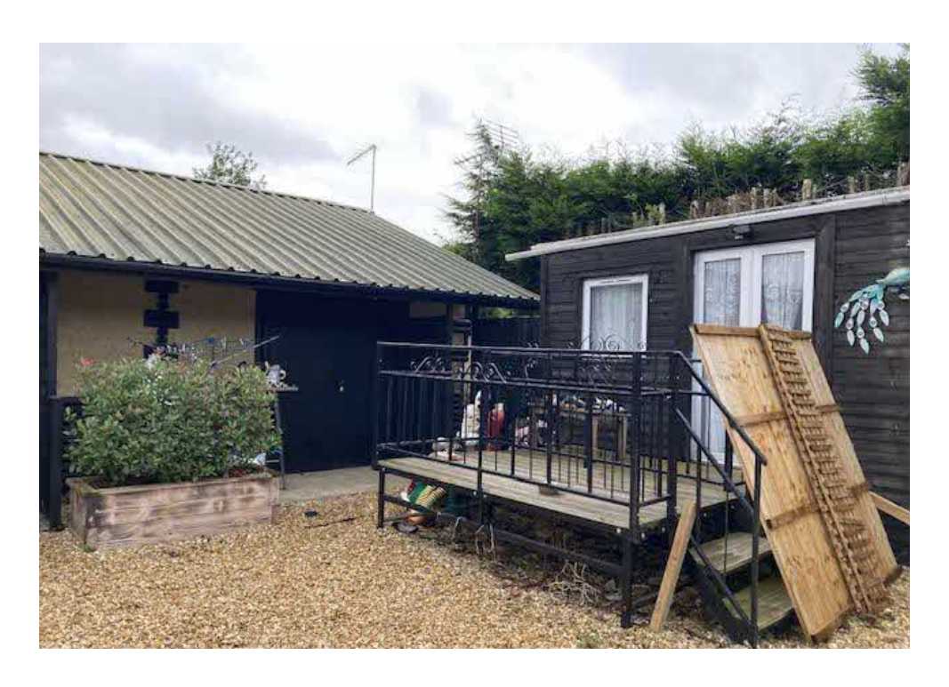
11. The south end of the amenity building adjacent to the second amenity building.