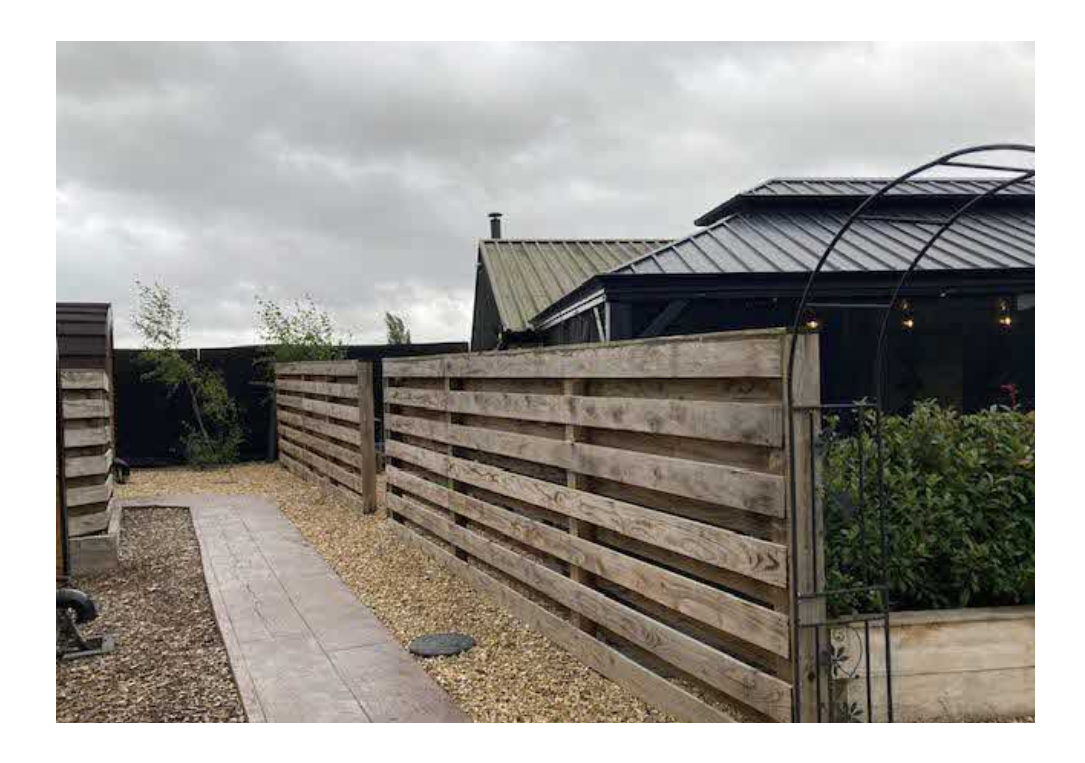
8. Outside the timber north east screen fence.