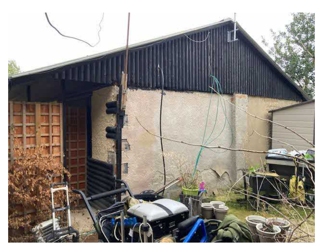
12. The south west gable end of the amenity building.