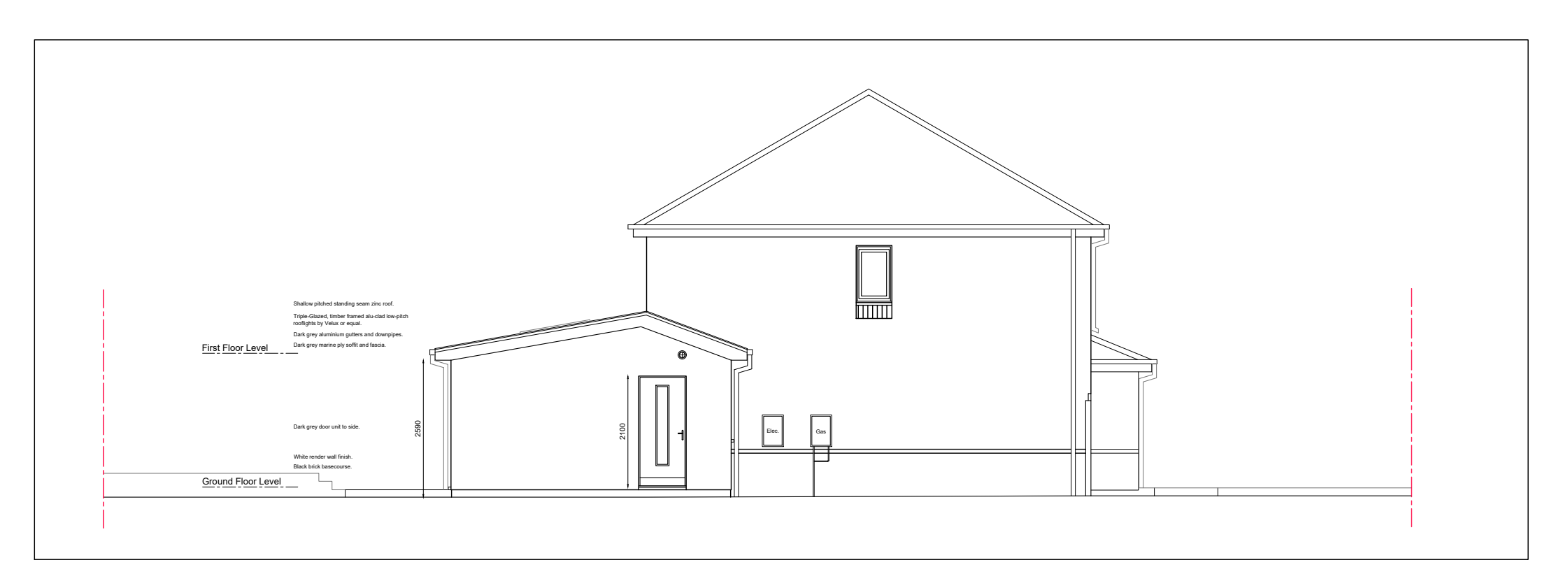
West (Side) Elevation as Proposed @ 1:100