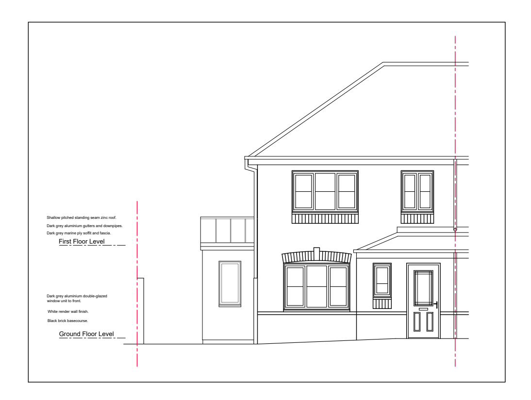
South (Front) Elevation as Proposed @ 1:100