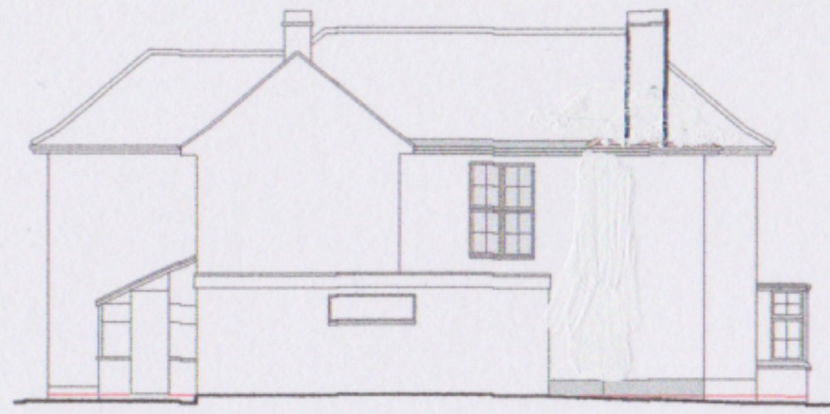
PROPOSED REAR ELEVATION 1:50 @ A1