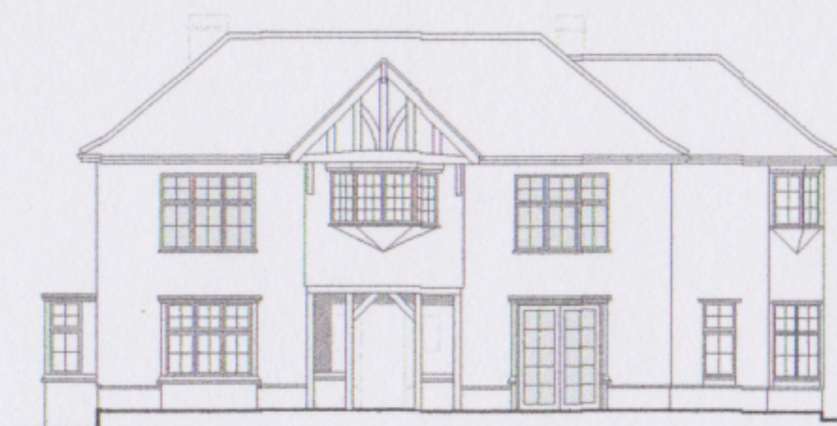
PROPOSED FRONT ELEVATION 1:50 @ A1