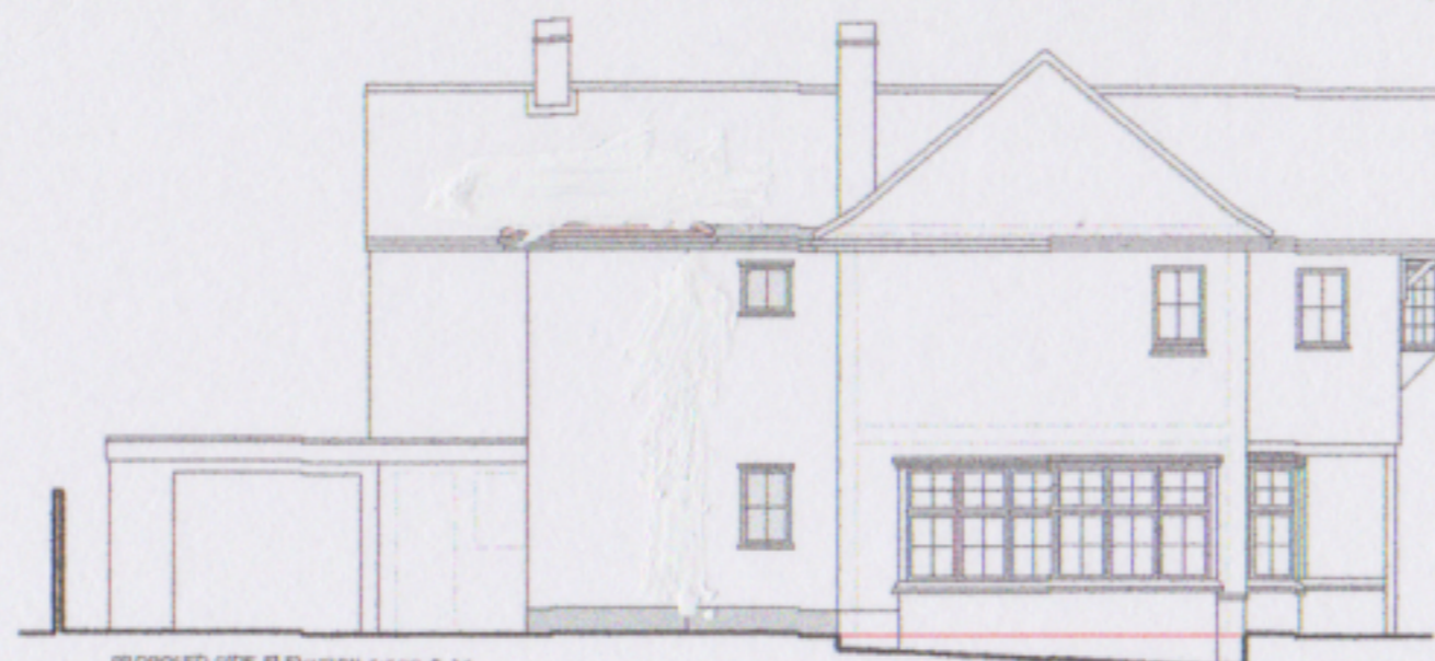
PROPOSED SIDE ELEVATION 1:50 @ A1