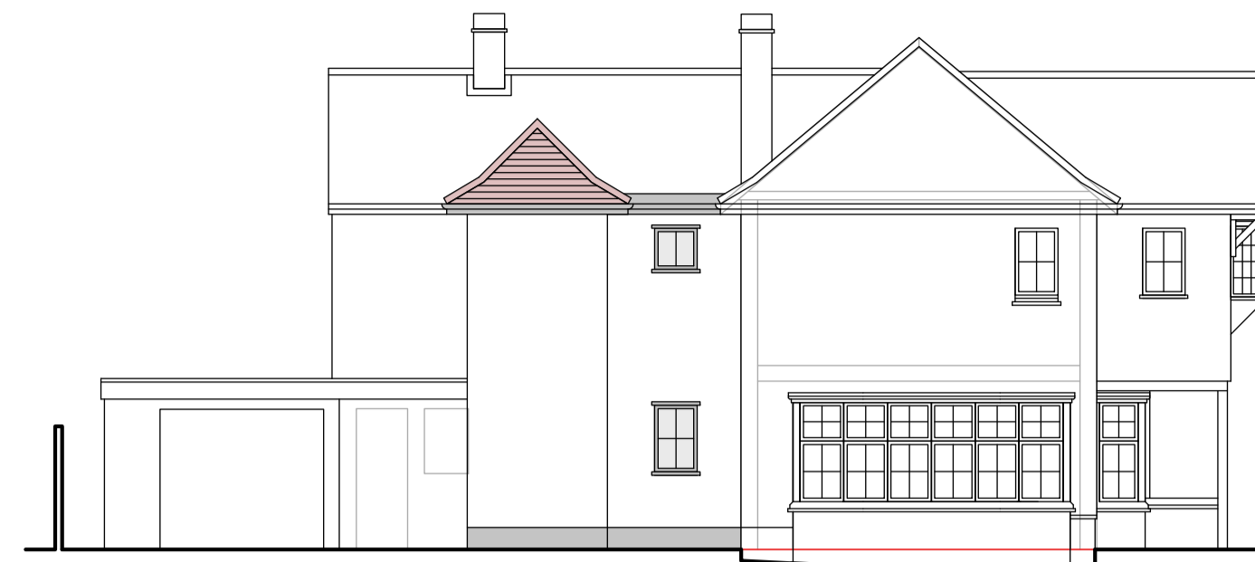
PROPOSED SIDE ELEVATION 1:100 @ A1