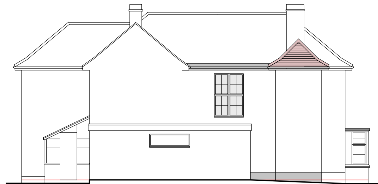
PROPOSED REAR ELEVATION 1:100 @ A1