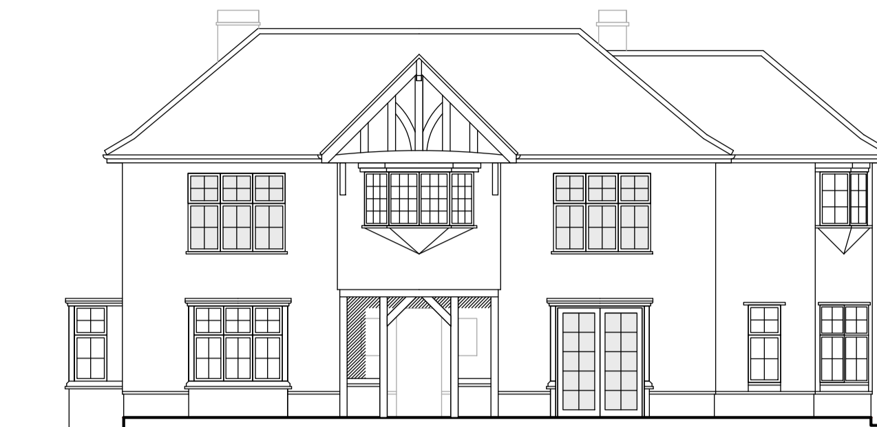
PROPOSED FRONT ELEVATION 1:100 @ A1