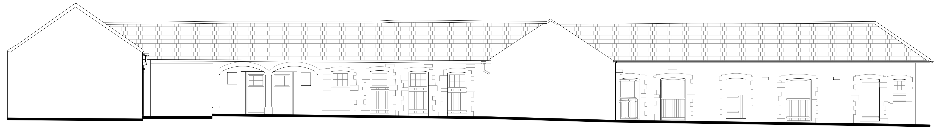
Existing Elevation G (Inner/Outer Courtyard) Scale 1:100

PROPOSED MATERIALS: Wall Infill Areas + Vertical composite cladding in anthracite colour. + Brickwork to match existing. + Stonework to match existing. Windows - UPVC in anthracite colour. Doors - UPVC in anthracite colour. Rainwater Goods - To match existing. Black pvc.