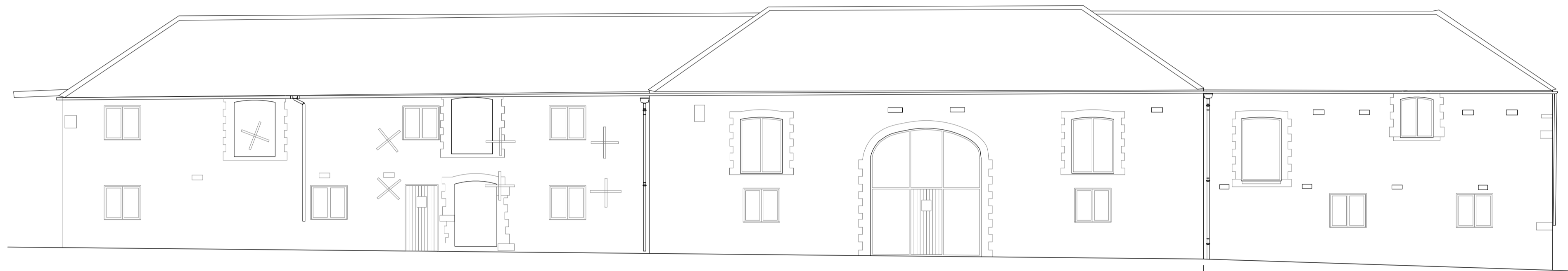
Approved - Proposed Elevation B (NW Facing) Scale 1:100