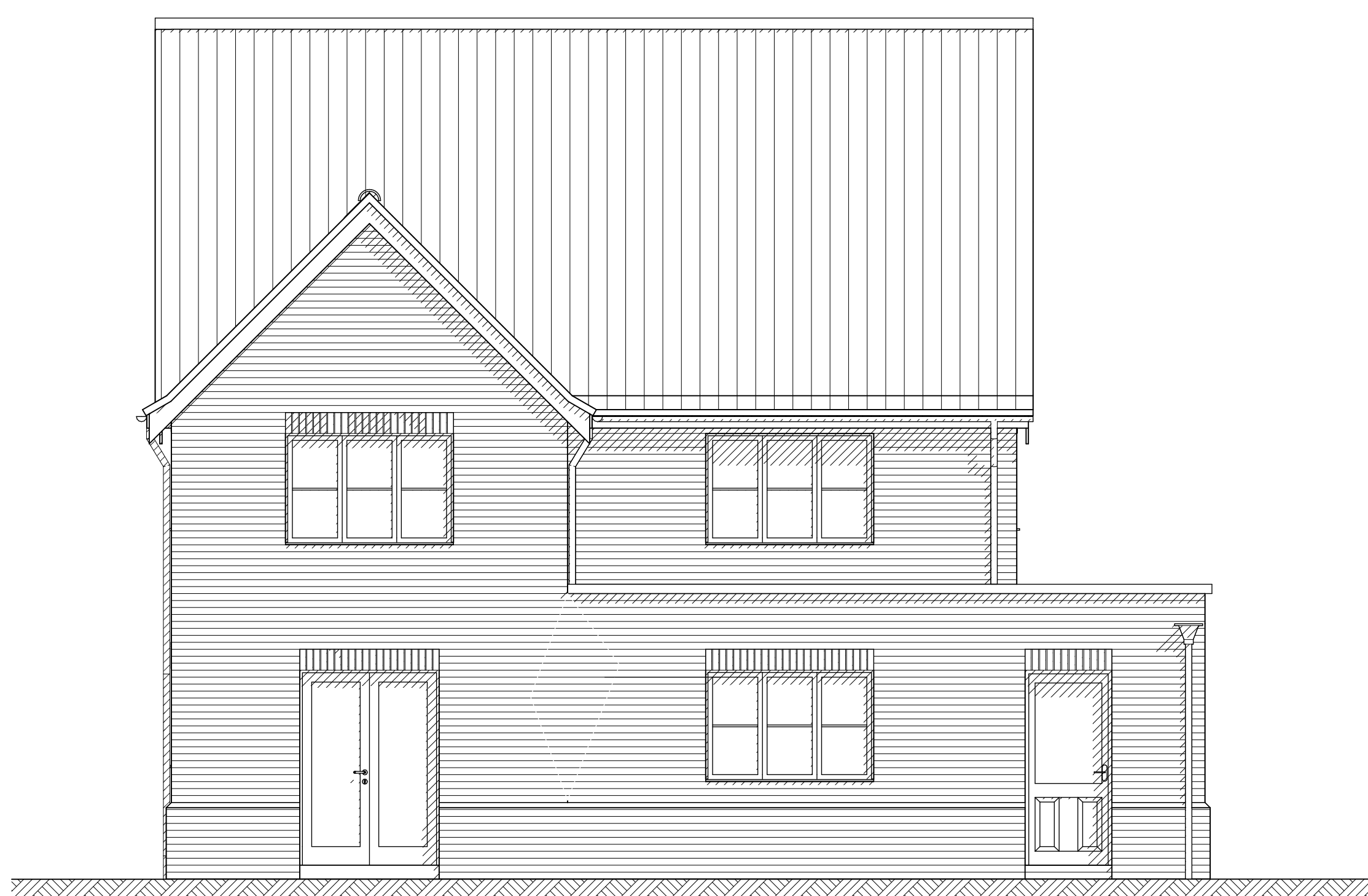
East elevation proposed