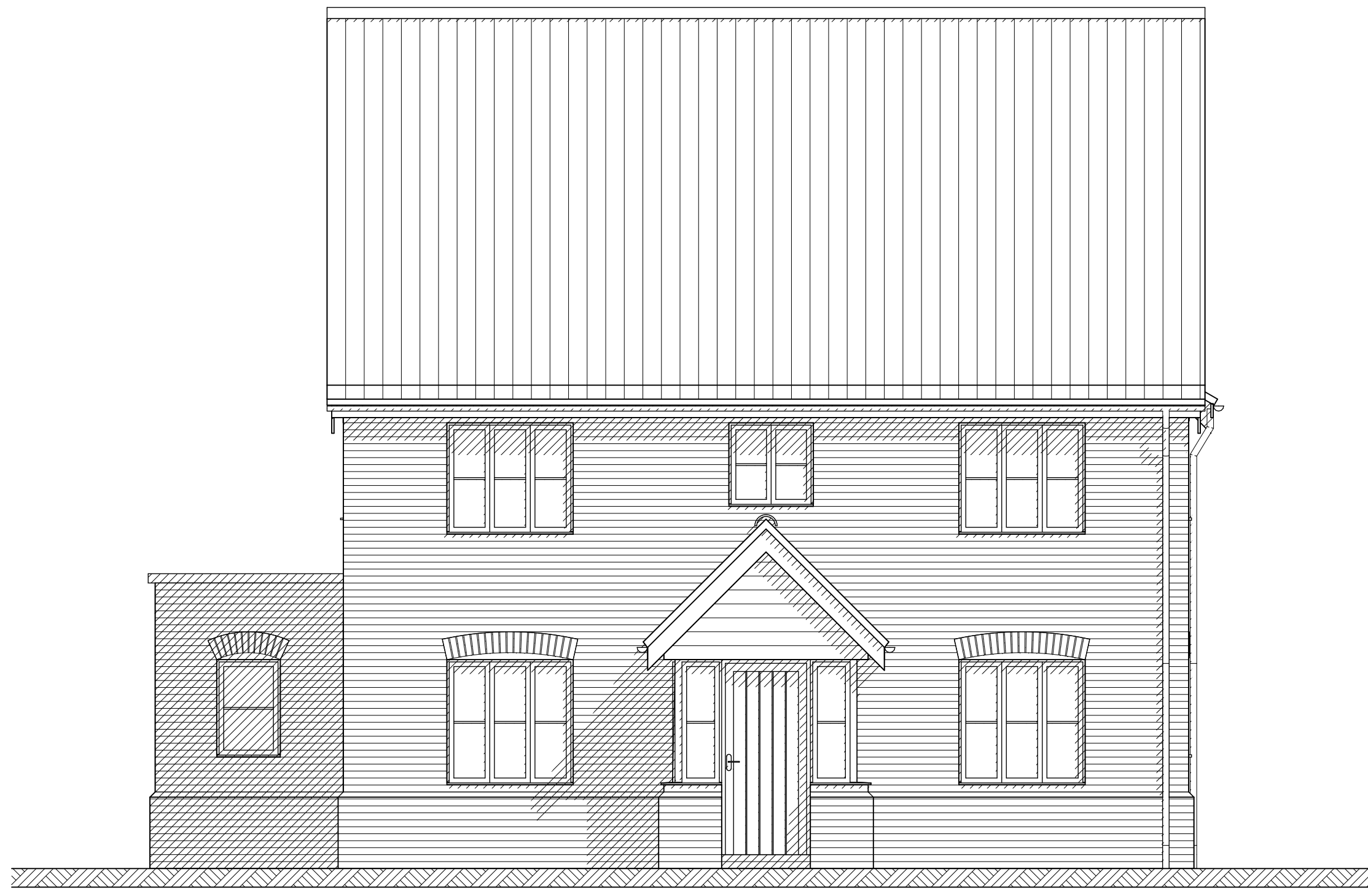
West elevation proposed