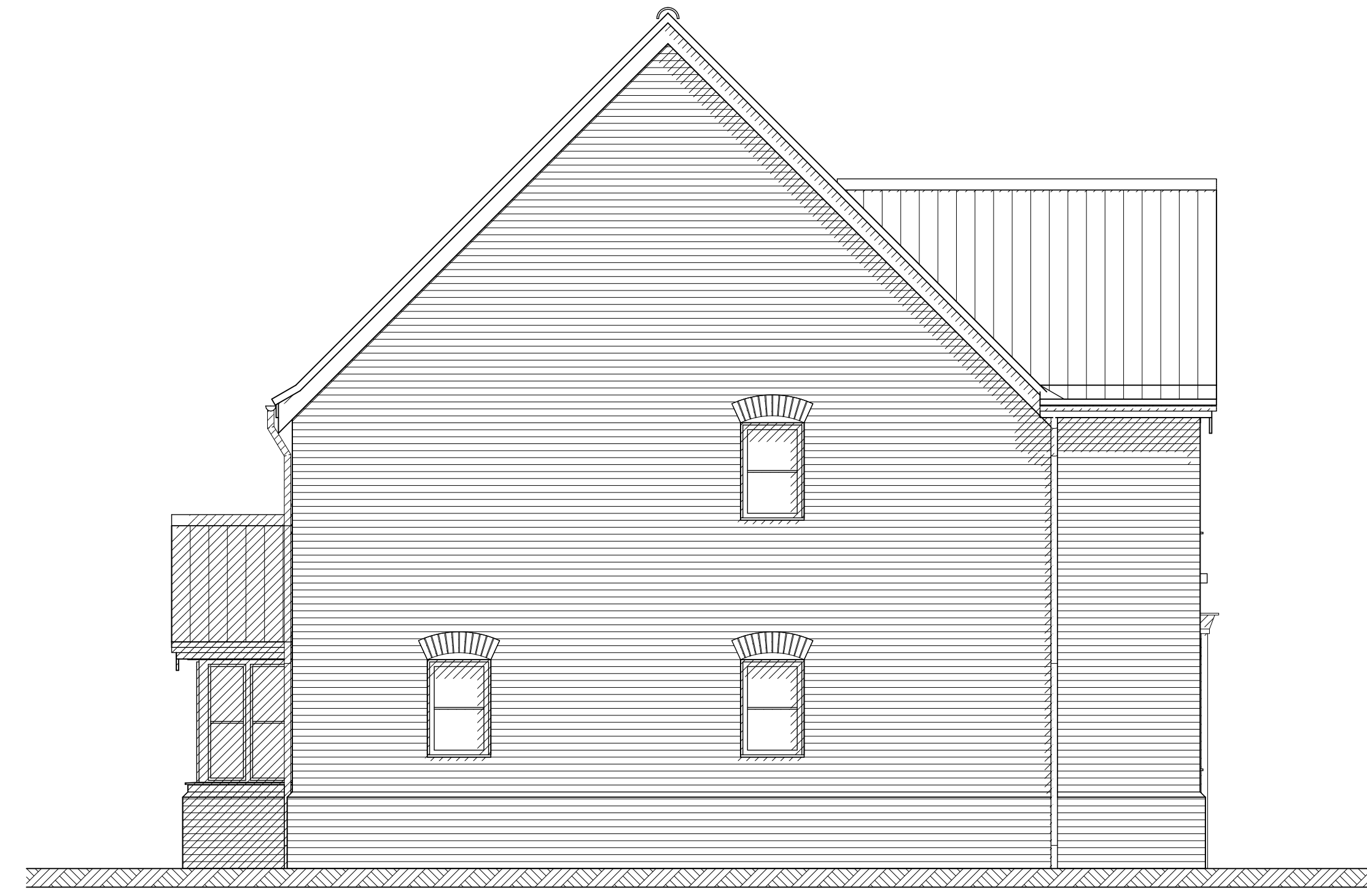
South elevation proposed