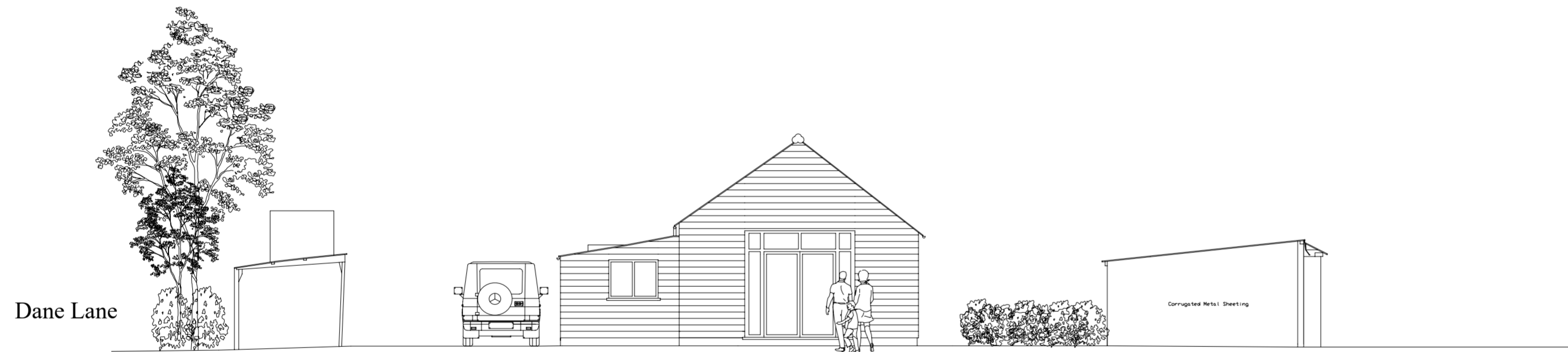
Front Elevation - Existing Prior Approval Scheme

Copyright, design rights or other intellectual property rights in this drawing remain the property of Peshurst Planning Ltd. The plans may not be copied, used, disclosed or passed to any third party for any other purpose without the express consent of Peshurst Planning Ltd.