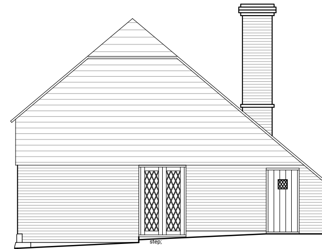
Existing Side Elevation Scale 1:100