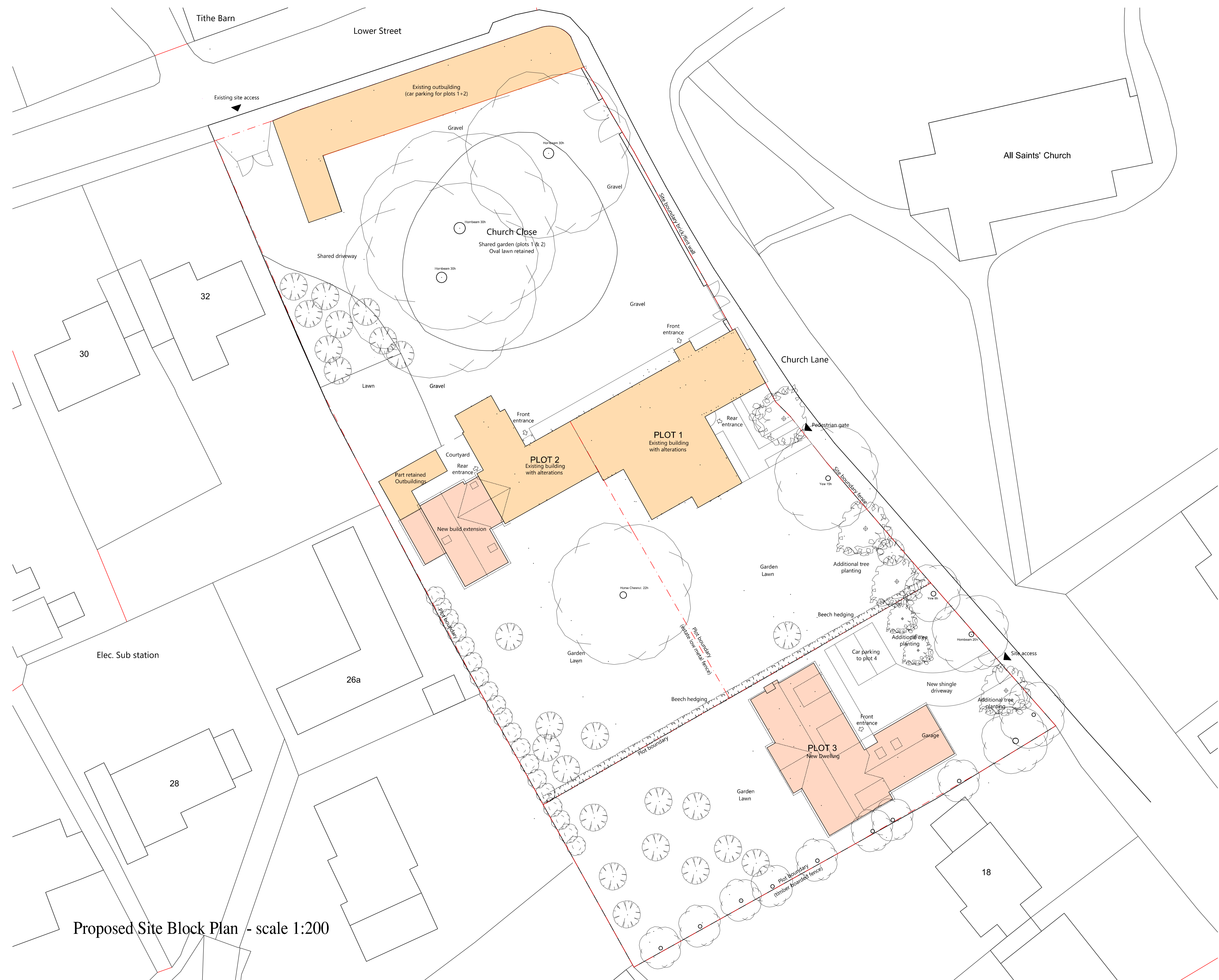
Proposed Site Block Plan - scale 1:200