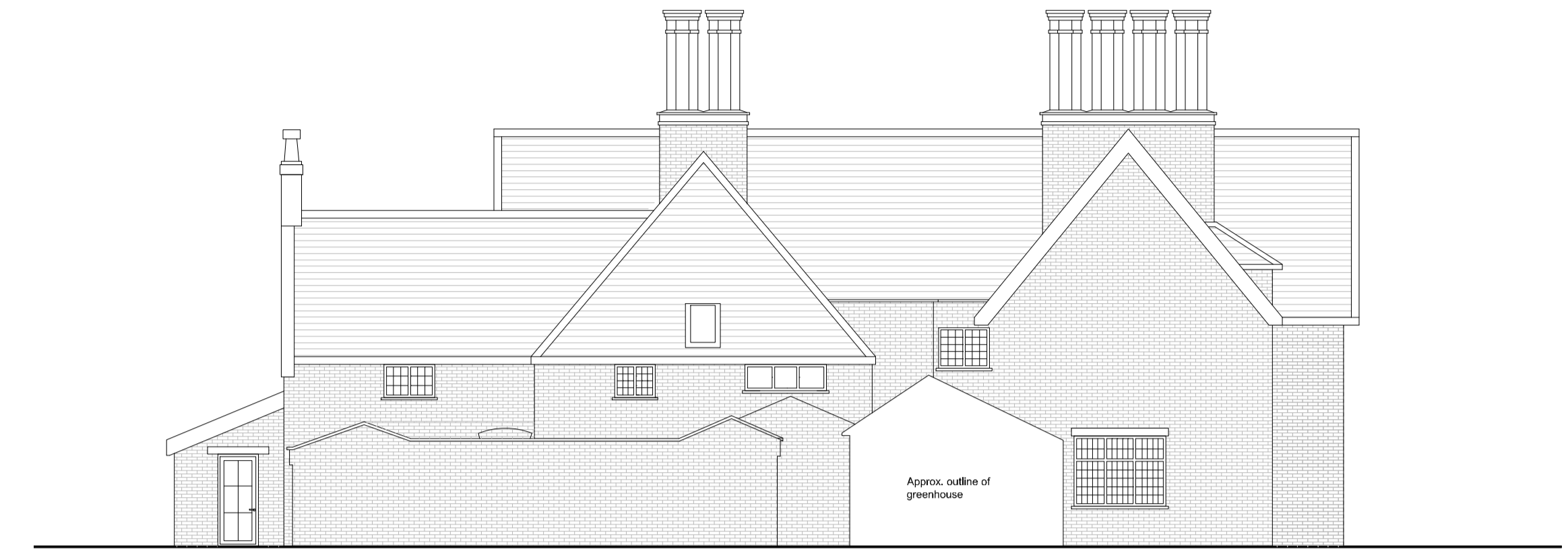
Existing West Elevation - scale 1:100