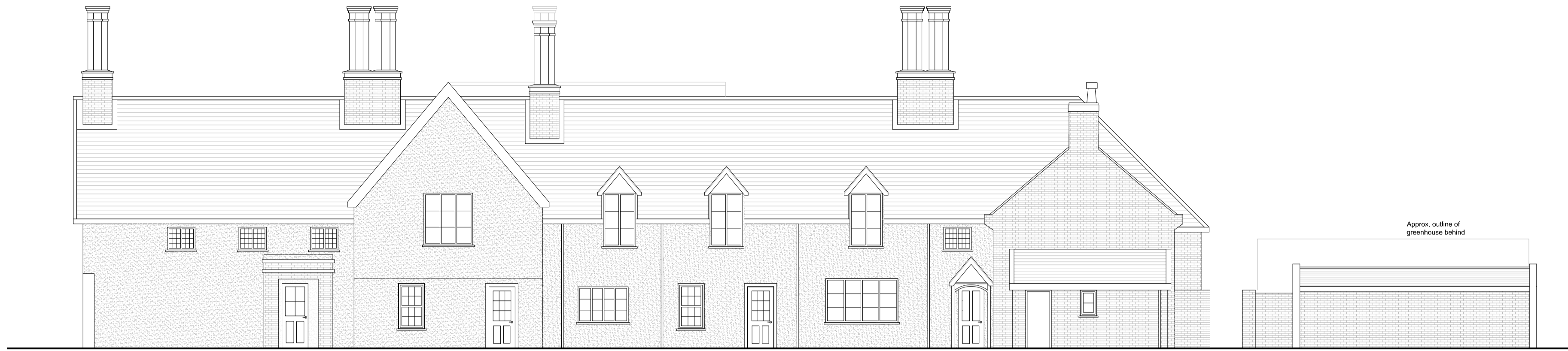
Existing North Elevation - scale 1:100