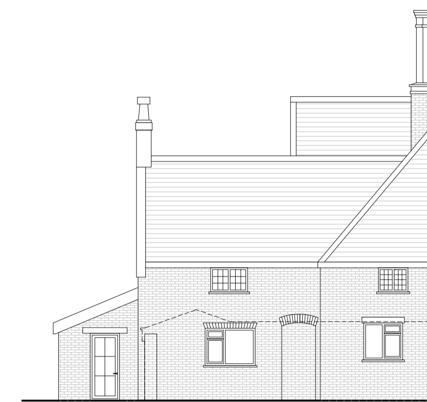
Existing West Part Elevation from Courtyard - scale 1:100

THIS INFORMATION MUST BE CHECKED ON SITE AND ANY RISKS IDENTIFIED BY OTHER PARTIES REPORTED TO THE PRINCIPAL DESIGNER.