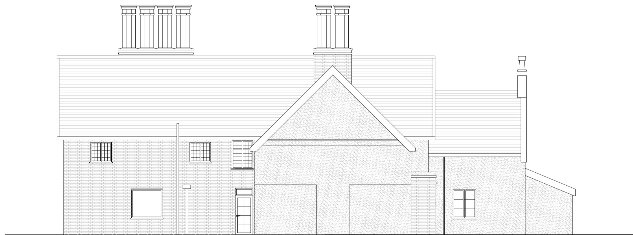
Existing East Elevation - scale 1:100