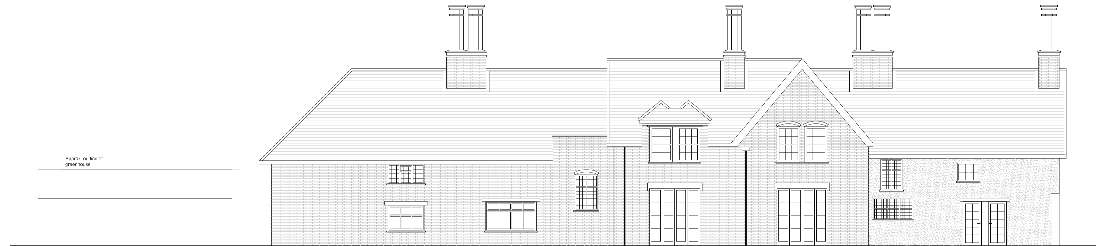
Existing South Elevation - scale 1:100