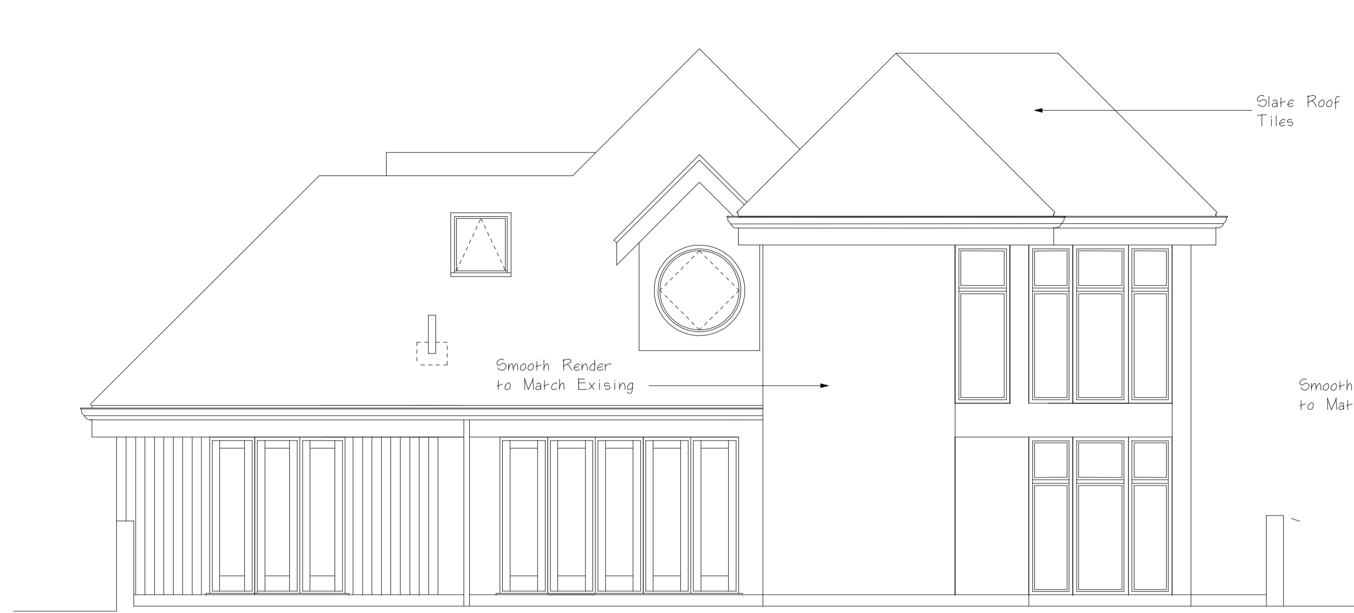
Proposed Side Elevation ( East )