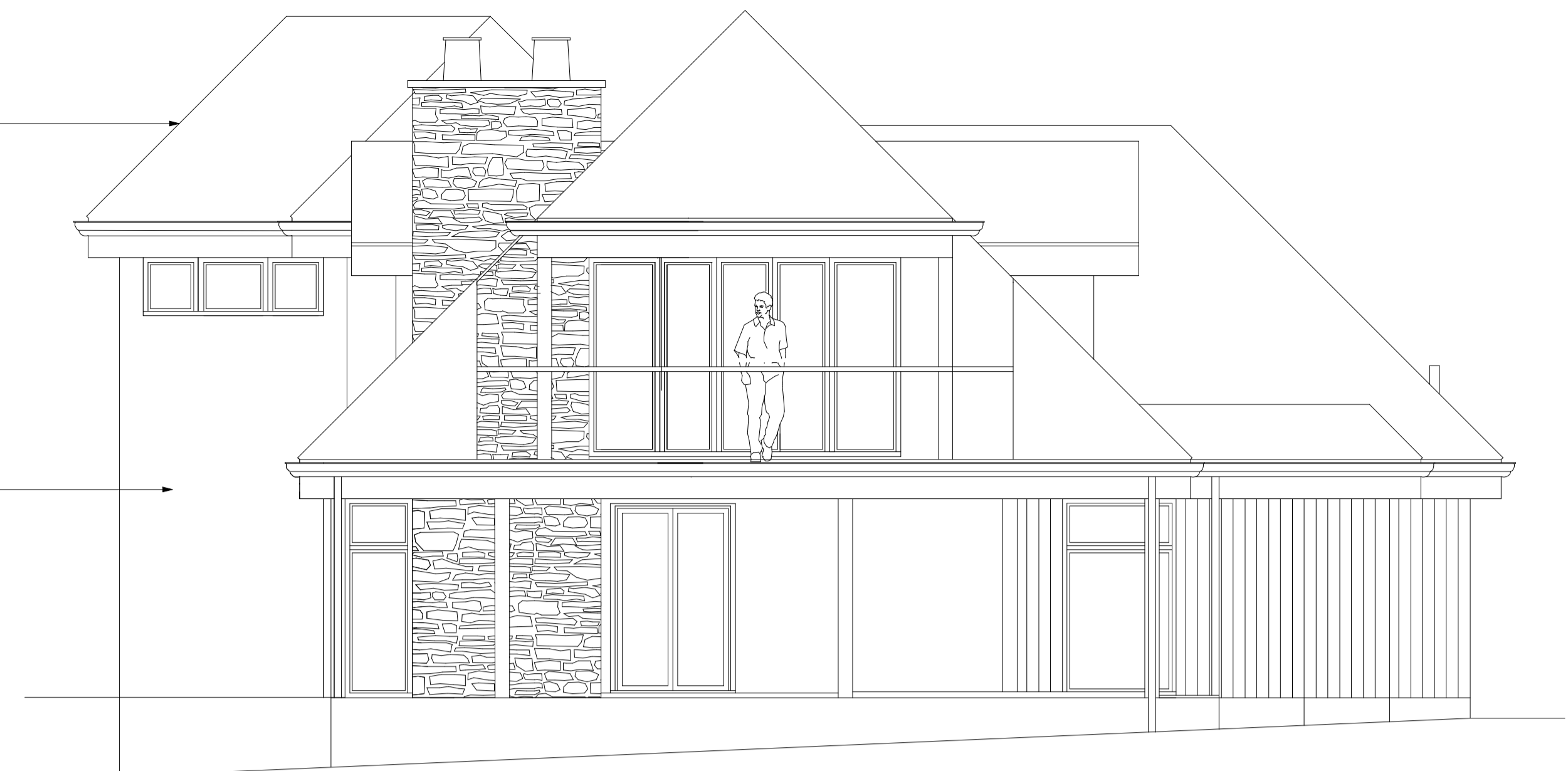
Side Elevation ( West )