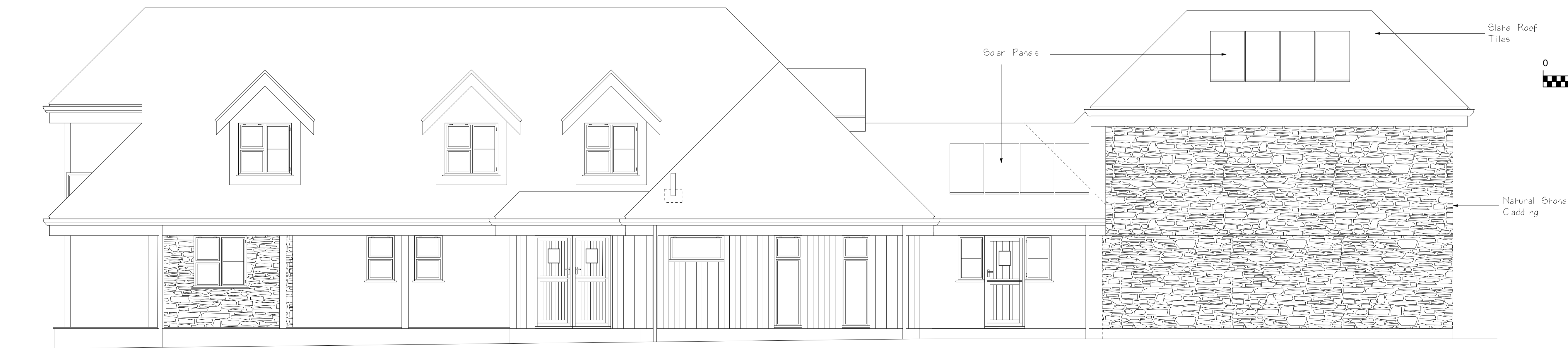
Proposed Front Elevation ( South )